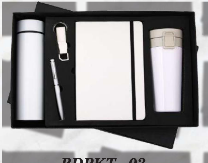
BDPKT - 03 Rs.1800/-