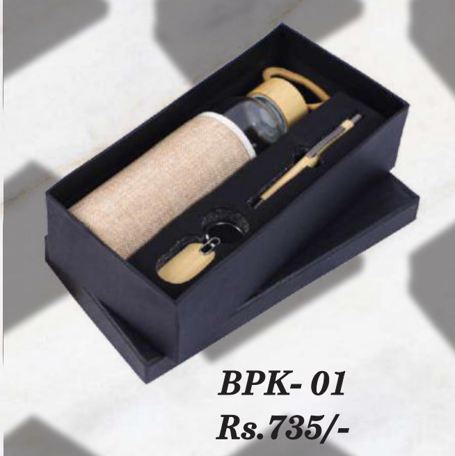
BPK- 01 Rs.735/-

HSN - 732310 | GST RATE 18% | MASTER CARTON PACKING 10 Qty