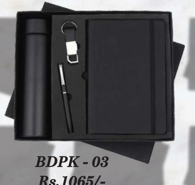
BDPK - 03 Rs.1065/-