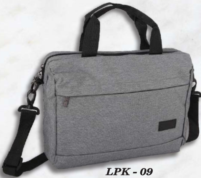
LPK - 09 Rs.990/-