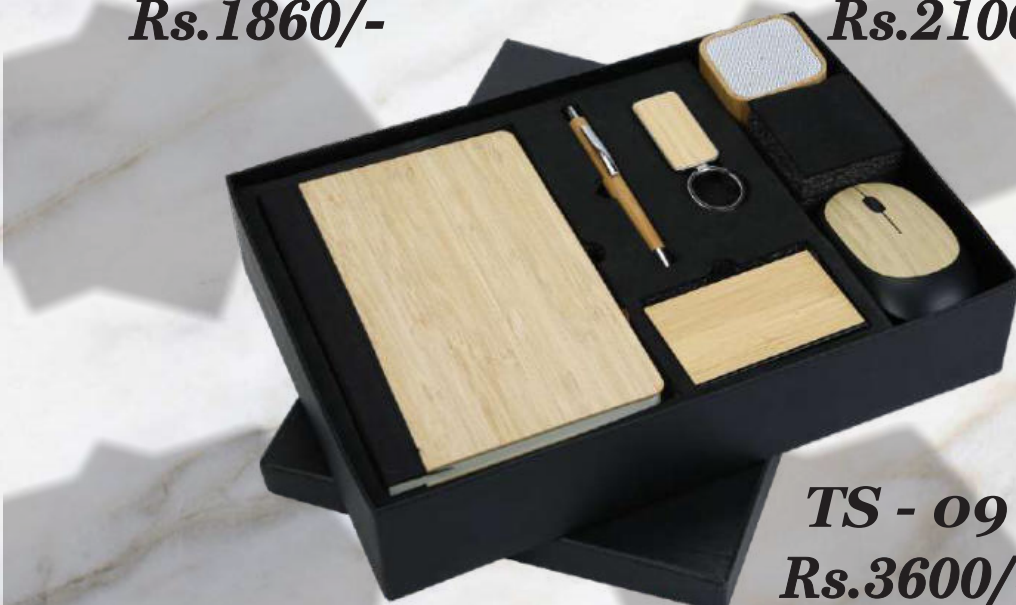
TS - 09 Rs.3600/-

Branding, Delivery & GST will be charged extra