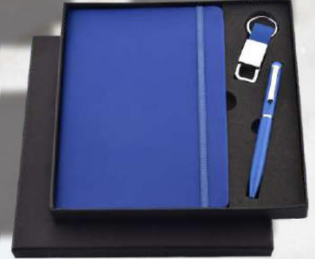
BL - 03 Rs.555/-