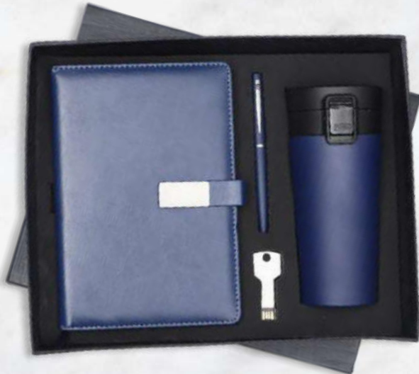
DPPT - 03 Rs.2280/-