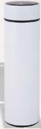
F - 04 Rs.375/-