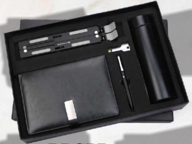
BDSPP - 02 Rs.2640/-