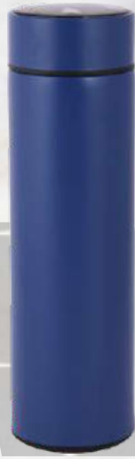
F - 02 Rs.375/-