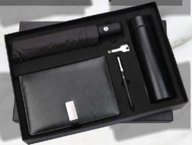
BUDPP - 02 Rs.2640/-