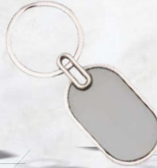
K - 07 Rs.66/-