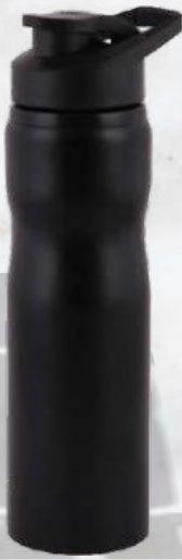
F - 09 Rs.390/-