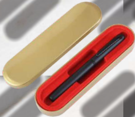
PB - 01 Rs.60/-

HSN - 732611 | GST RATE 18% | MASTER CARTON PACKING 100 Qty