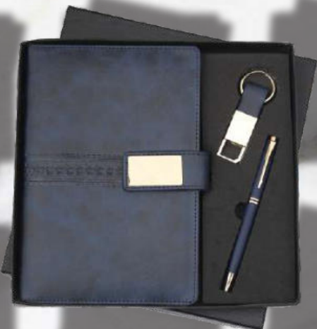
LG - 03 Rs.945/-