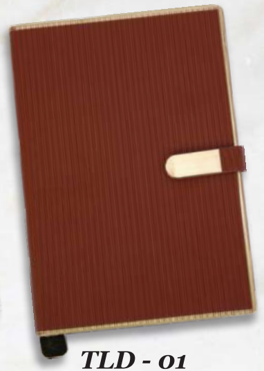
TLD - 01 Rs.315/-