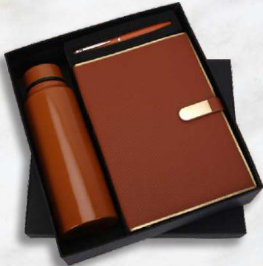
BDP - 08 Rs.1080/-