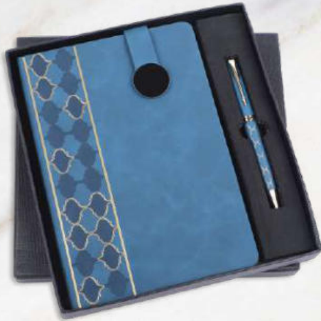
GW - 01 Rs.765/-

HSN - 482010 | GST RATE 18% | MASTER CARTON PACKING 30 Qty