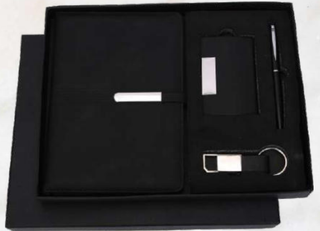
BC - 04 Rs.900/-