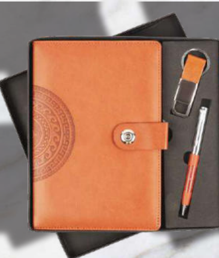
TD - 03 Rs.780/-