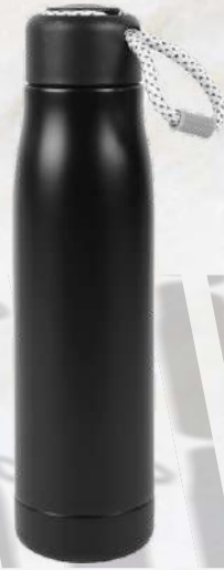
F - 05 Rs.600/-