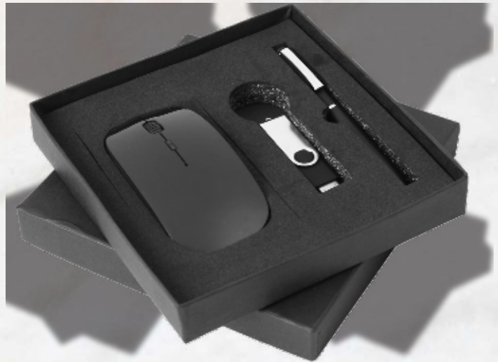
TS - 06 Rs.1365/-