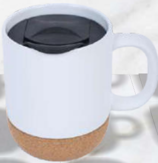
M - 11 Rs.510/-