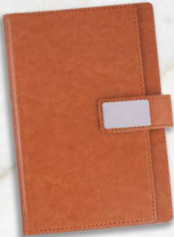
TOD - 01 Rs.420/-

HSN - 48101990 | GST RATE 18% | MASTER CARTON PACKING 100 Qty