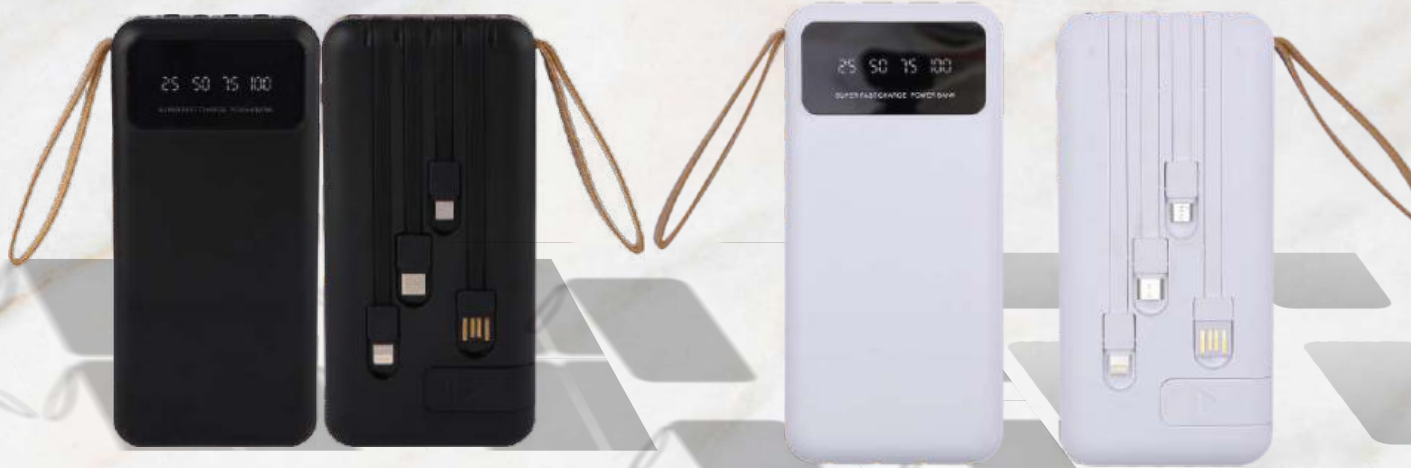
10000 Mah Display Power bank with 3 output cables

HSN - 850760 | GST RATE 18% | MASTER CARTON PACKING 40/20 Qty