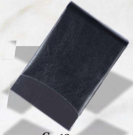
C - 12 Rs.180/-