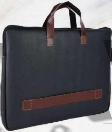
LPK - 01 Rs.540/-

HSN - 42021990 | GST RATE 18% | MASTER CARTON PACKING 25 Qty