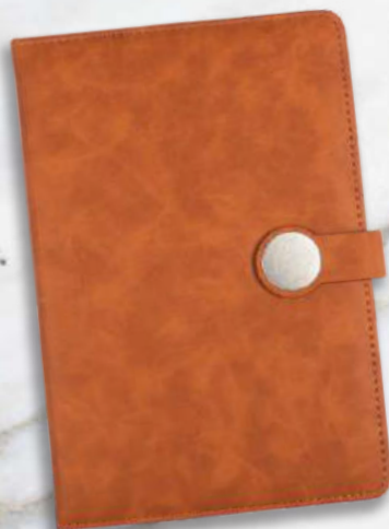
TRD - 01 Rs.360/-