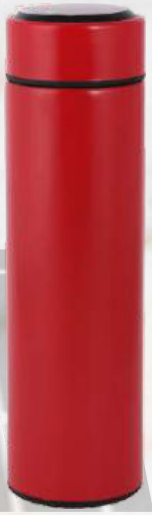
F - 01 Rs.375/-

HSN - 73239420 | GST RATE 18% | MASTER CARTON PACKING 50 Qty