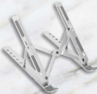
LS - 01 Rs.420/-