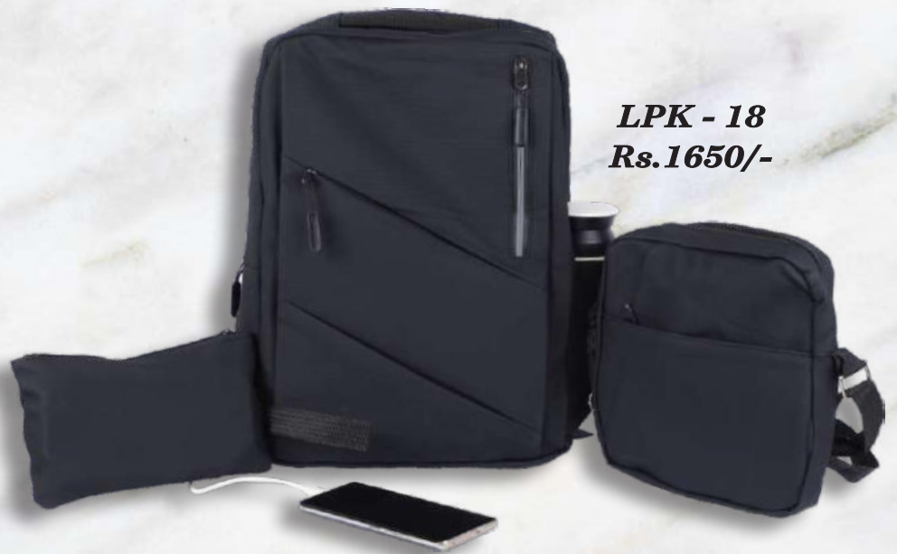
LPK - 18 Rs.1650/-