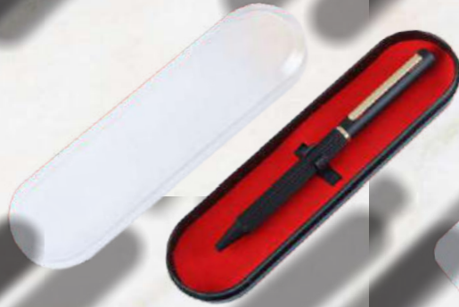
PB - 02 Rs.54/-