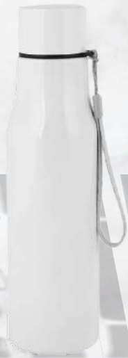
F - 08 Rs.405/-