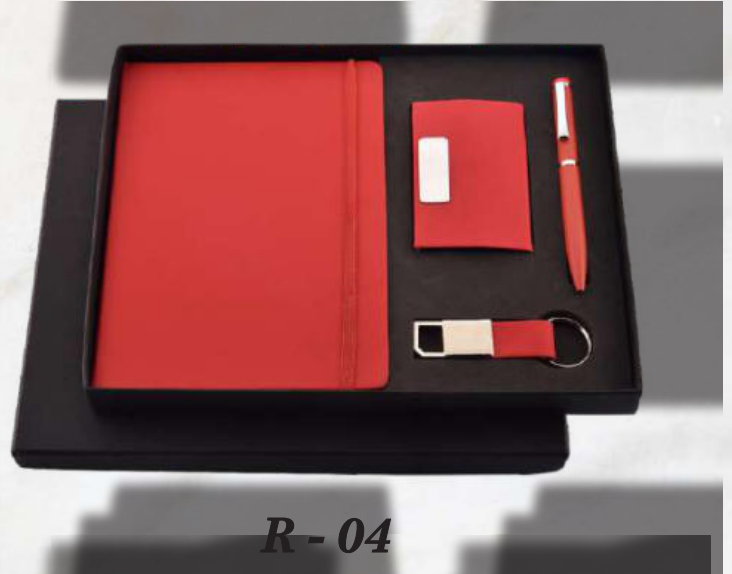
R - 04 Rs.765/-