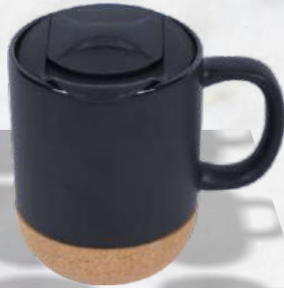
M - 12 Rs.510/-

Branding, Delivery & GST will be charged extra