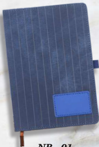
NR - 01 Rs.405/-