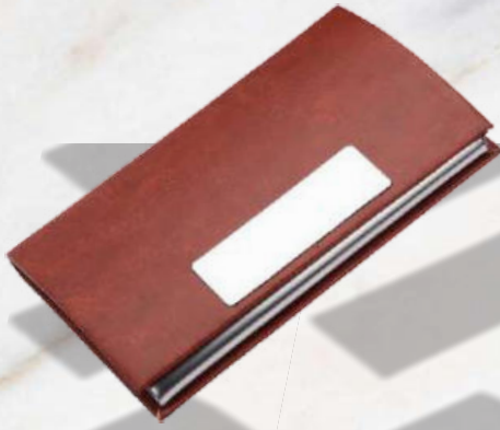
C - 01 Rs.120/-

HSN - 392690 | GST RATE 18% | MASTER PACKING 100 Qty