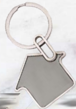
K - 08 Rs.75/-