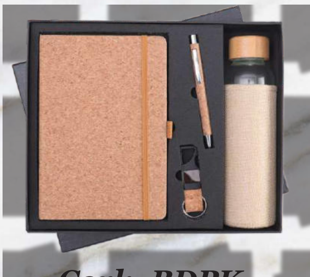
Cork- BDPK Rs.1200/-