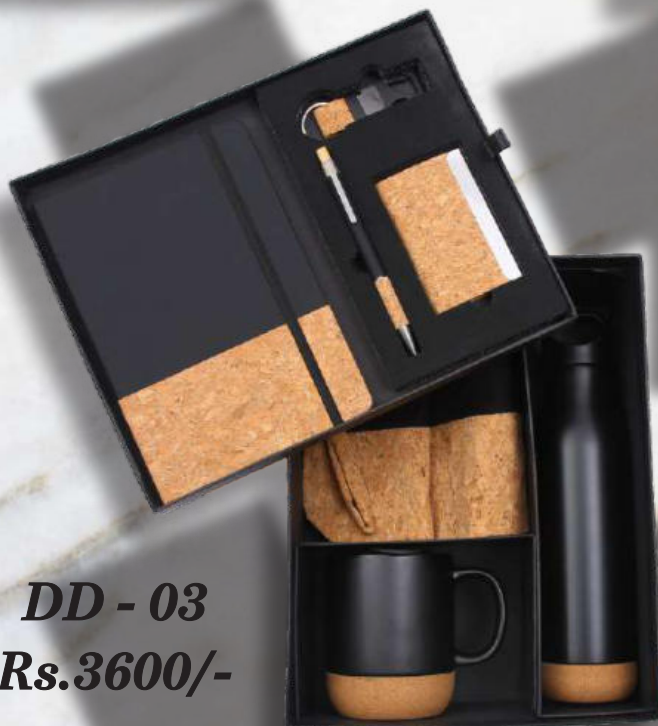
DD - 03 Rs.3600/-

Branding, Delivery & GST will be charged extra