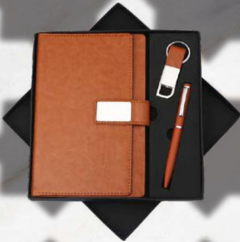
TO - 03 Rs.765/-

HSN - 420211 | GST RATE 18% | MASTER CARTON PACKING 40 Qty