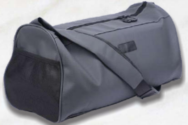
LPK - 13 Rs.900/-