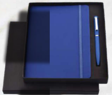
BL - 02 Rs.390/-