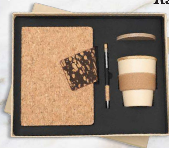
ECO 4-1 Rs.1875/-

Branding, Delivery & GST will be charged extra