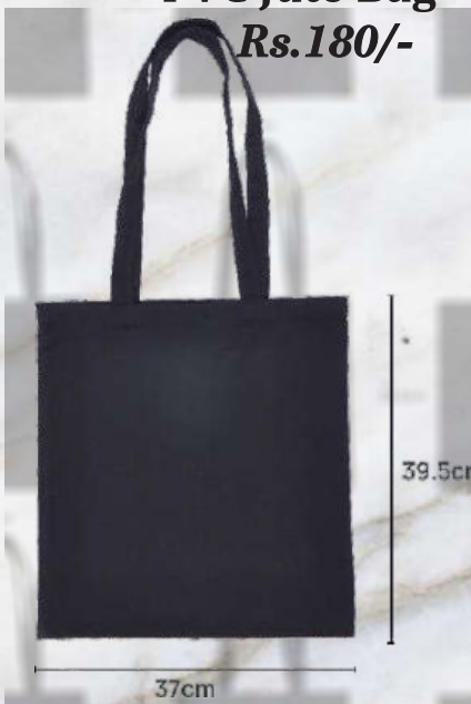
Black Tote Bag Rs.195/-