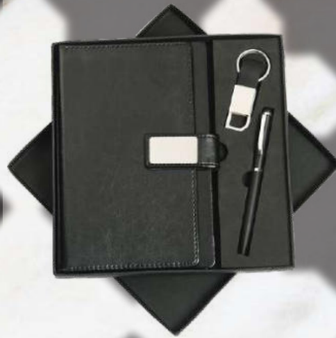
BO - 03 Rs.765/-