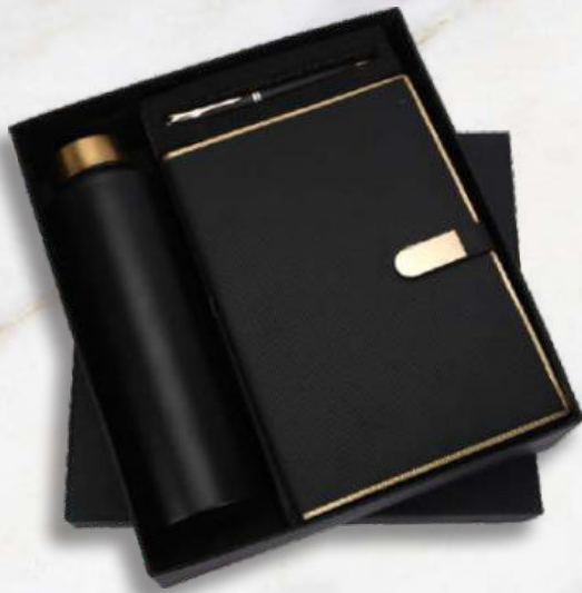
BDP - 06 Rs.1290/-

HSN - 732393 | GST RATE 18% | MASTER CARTON PACKING 10 Qty