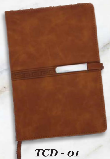
TCD - 01 Rs.360/-