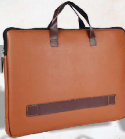
LPK - 02 Rs.540/-