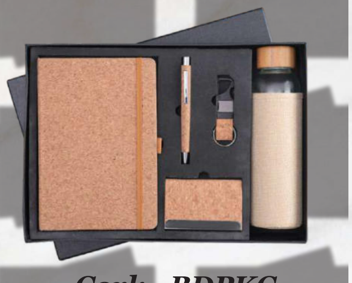
Cork - BDPKC Rs.1545/-