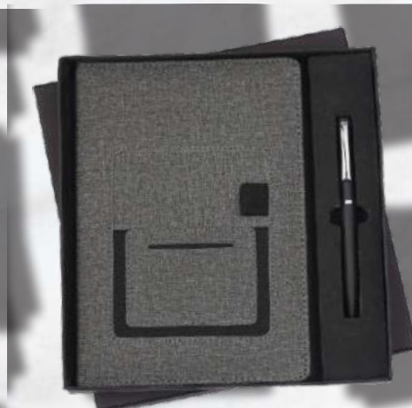
JP - 02 Rs.525/-