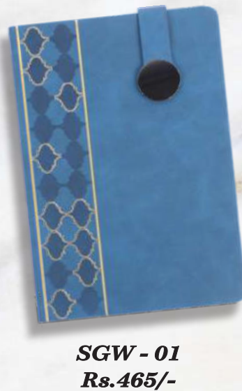
SGW - 01 Rs.465/-