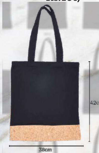
Cork Tote Bag Rs.225/-