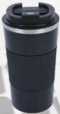
M - 06 Rs.780/-