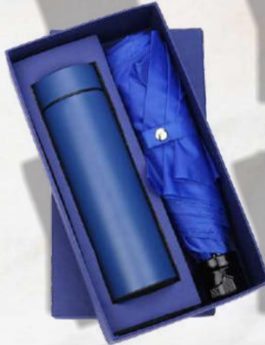
BU - 02 Rs.1140/-