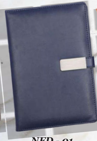
NFD - 01 Rs.300/-