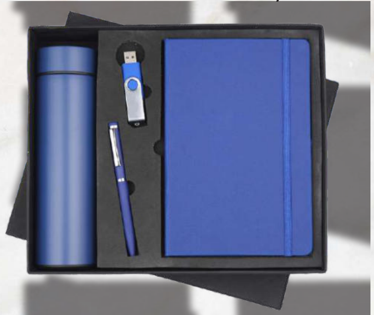
BPPD - 02 Rs.1710/-