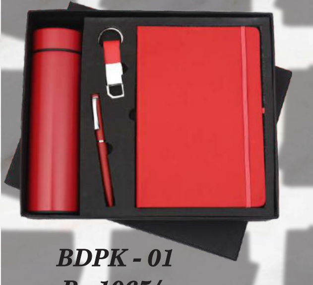
BDPK - 01 Rs.1065/-

HSN - 732310 | GST RATE 18% | MASTER CARTON PACKING 10 Qty