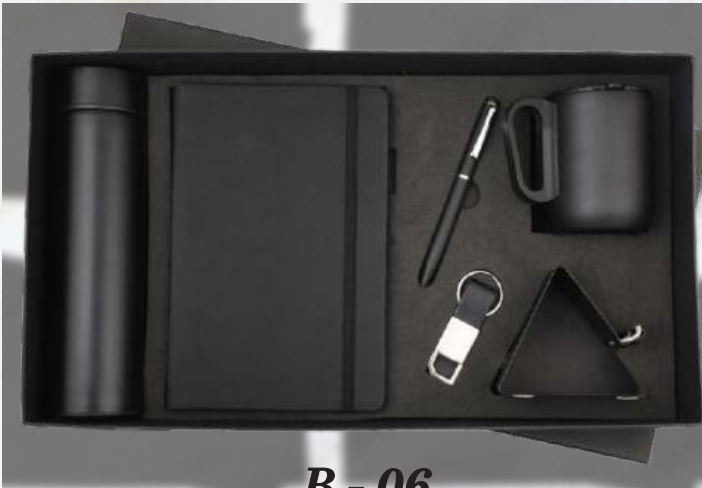
B - 06 Rs.1830/-