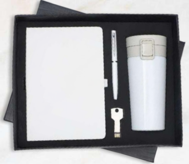
DPPT - 02 Rs.2070/-