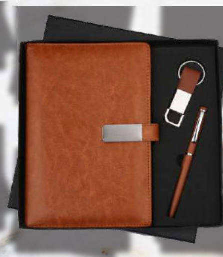
BF - 03 Rs.705/-