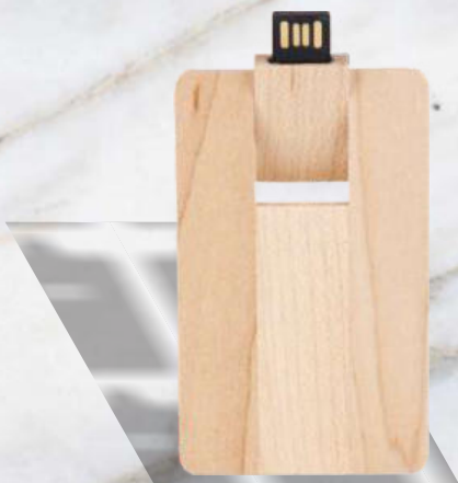
Wooden Card Pendrive