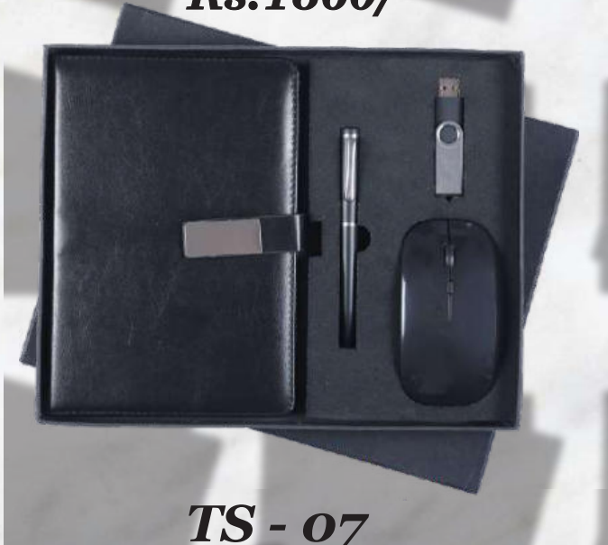
TS - 07 Rs.1860/-