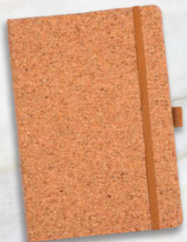
C - 01 Rs.255/-

Branding, Delivery & GST will be charged extra