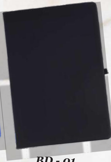
BD - 01 Rs.171/-