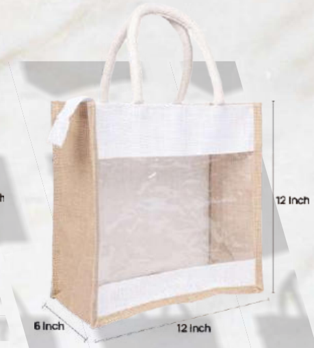
PVC Jute Bag Rs.225/-