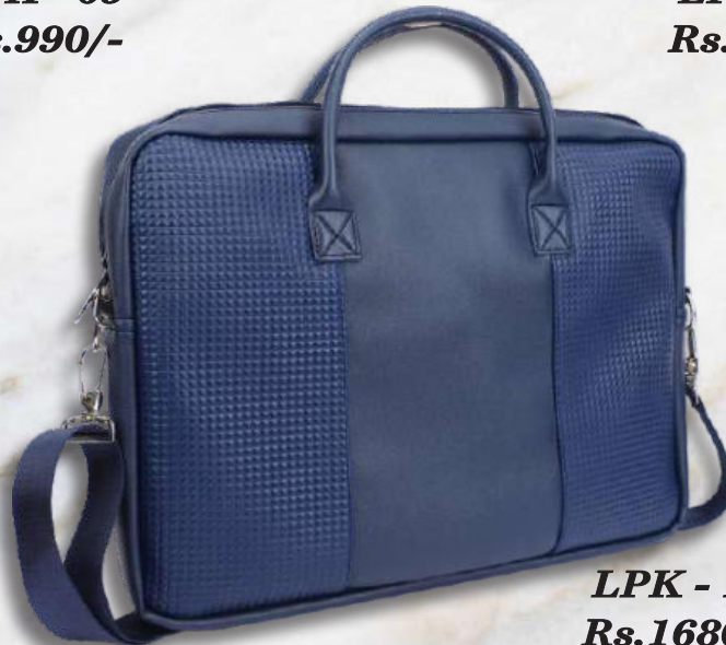
LPK - 11 Rs.1680/-

Branding, Delivery & GST will be charged extra