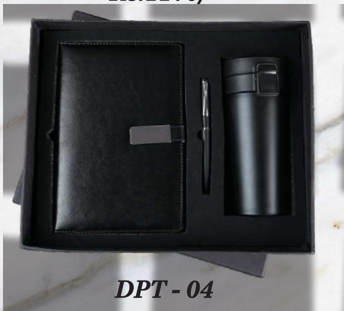
DPT - 04 Rs.1290/-