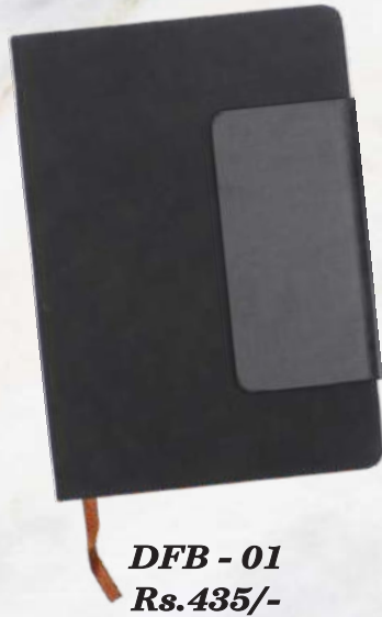
DFB - 01 Rs.435/-