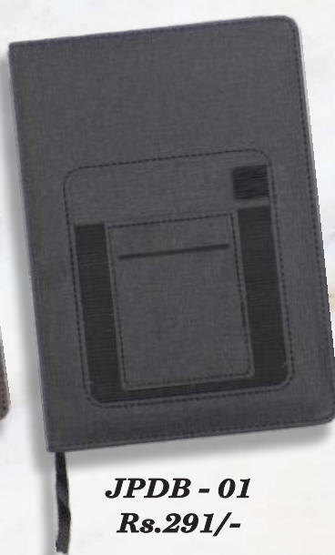
JPDB - 01 Rs.291/-