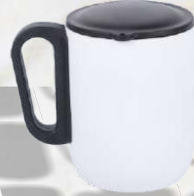
M - 04 Rs.345/-