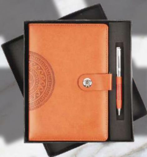
TD - 02 Rs.645/-