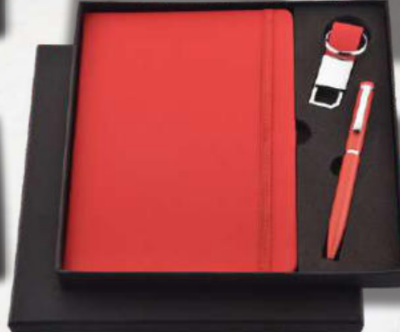
R - 03 Rs.555/-