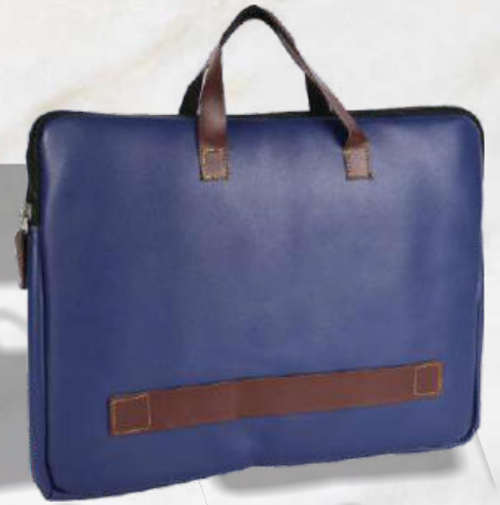
LPK - 03 Rs.540/-