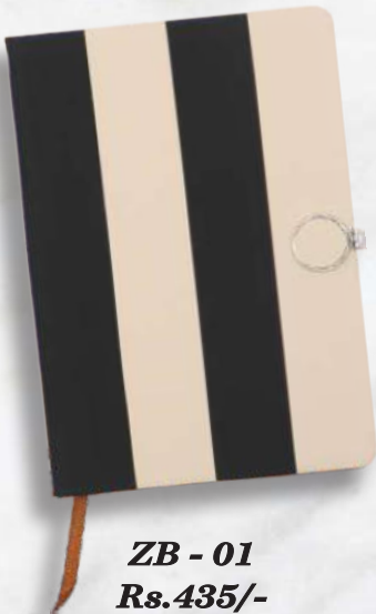
ZB - 01 Rs.435/-