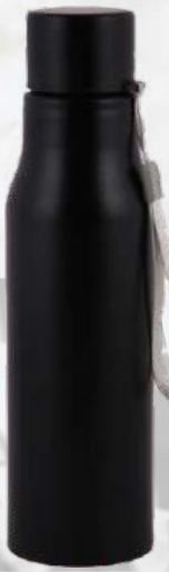
F - 07 Rs.405/-