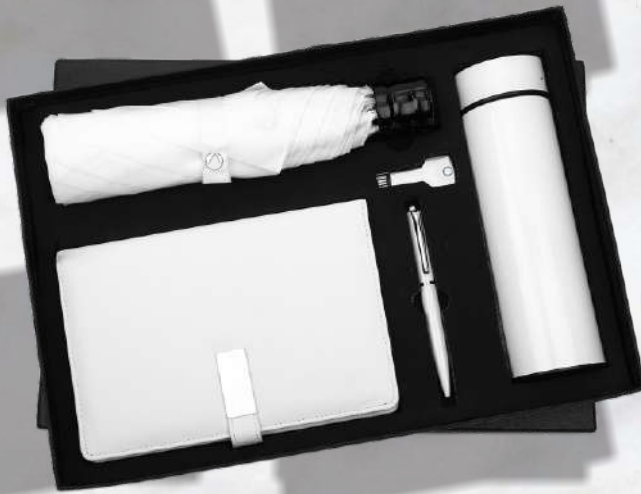
BUDPP - 01 Rs.2640/-