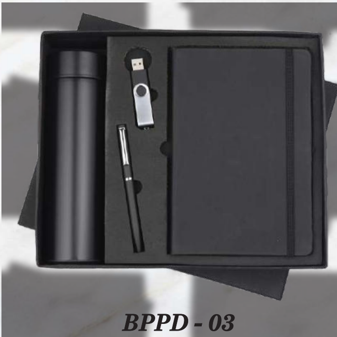
BPPD - 03 Rs.1710/-