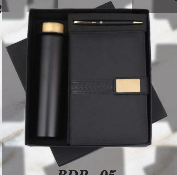
BDP - 05 Rs.530/-

Branding, Delivery & GST will be charged extra