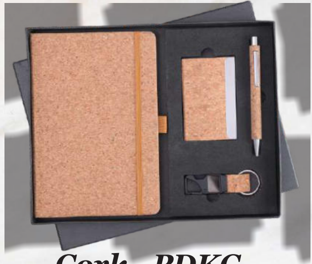
Cork - PDKC Rs.870/-