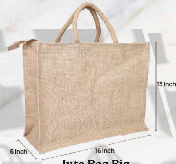
Jute Bag Big Rs.240/-

HSN - 42022230 | GST RATE 18% | MASTER CARTON PACKING 40 Qty