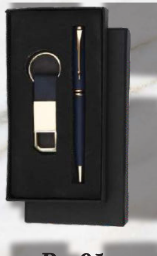
R - 01 Rs.375/-

Branding, Delivery & GST will be charged extra