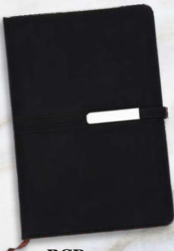
BCD - 01 Rs.360/-