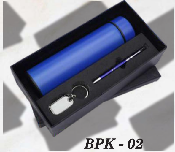
BPK - 02 Rs.735/-