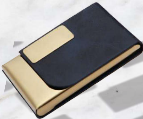
C - 07 Rs.210/-