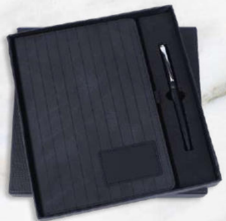
RB - 03 Rs.705/-