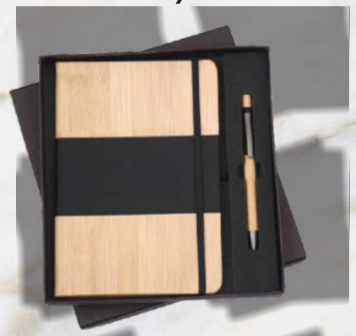
Bamboo Black - 02 Rs.555/-

Branding, Delivery & GST will be charged extra