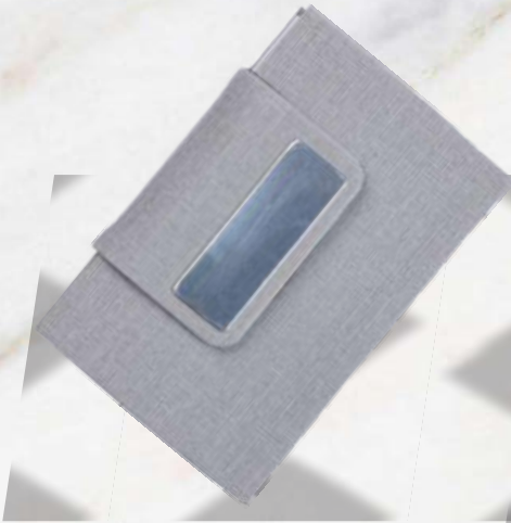
C - 10 Rs.180/-

HSN - 392690 | GST RATE 18% | MASTER CARTON PACKING 100 Qty