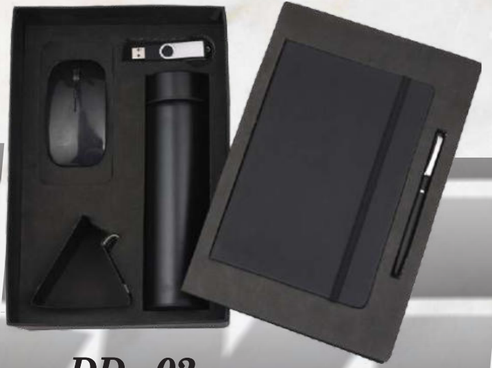
DD - 02 Rs.2565/-