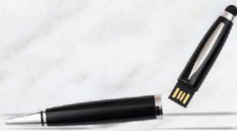
Pen Pendrive 01