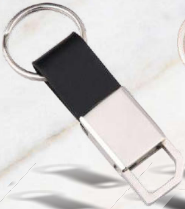
K - 01 Rs.96/-

HSN - 73261100 | GST RATE 18% | MASTER PACKING 50 Qty