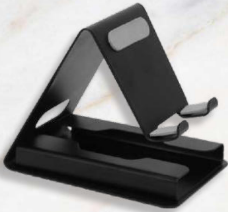
MS - 01 Rs.3600/-

HSN - 4411 | GST RATE 18% | MASTER CARTON PACKING 50 Qty