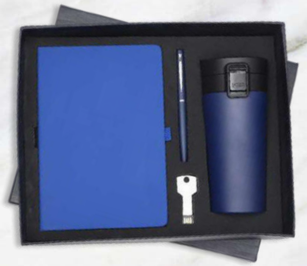
DPPT - 04 Rs.2220/-