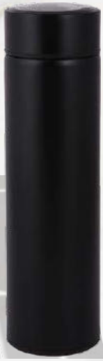
F - 03 Rs.375/-