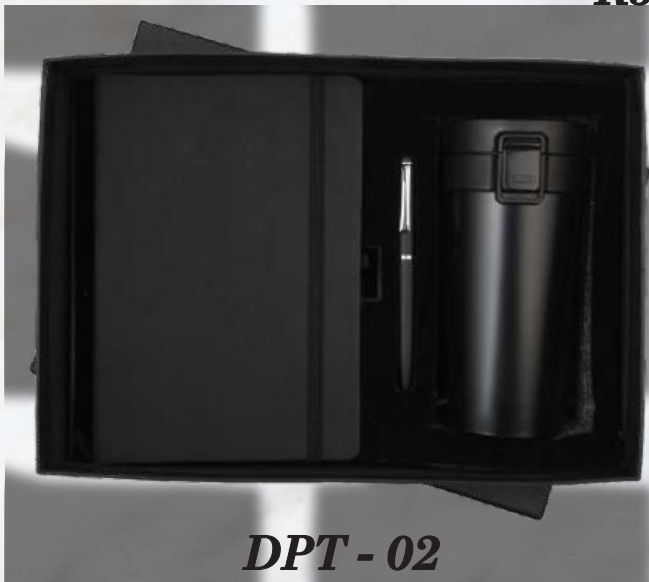
DPT - 02 Rs.1170/-