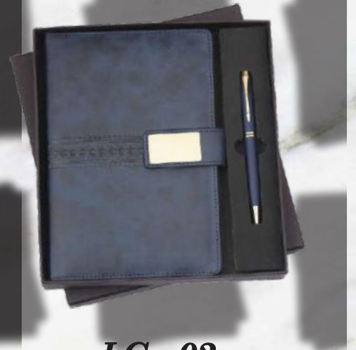
LG - 02 Rs.645/-