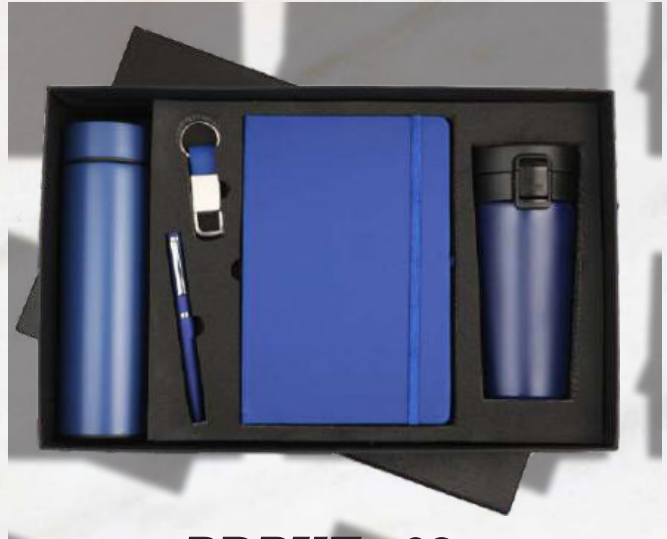
BDPKT - 02 Rs.2100/-