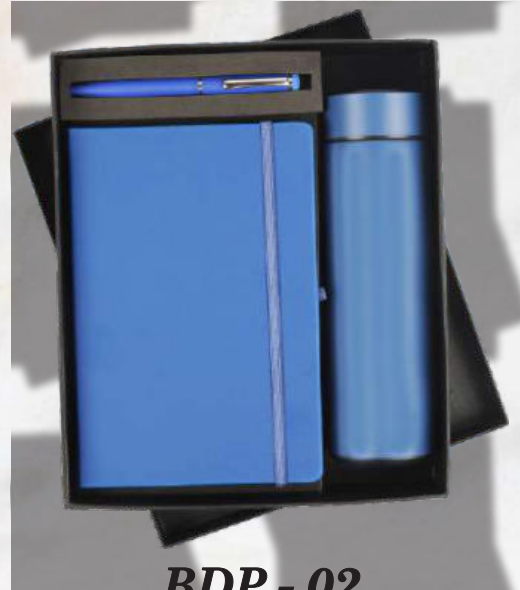
BDP - 02 Rs.930/-