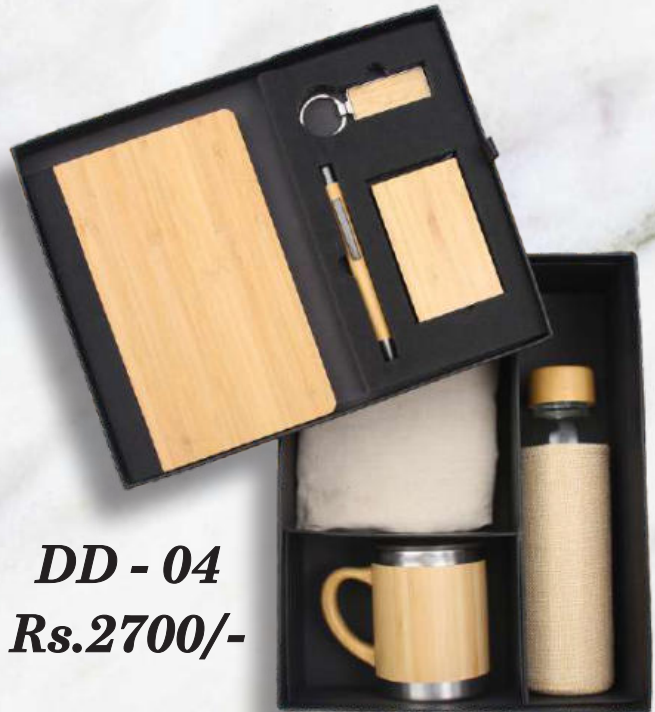
DD - 04 Rs.2700/-