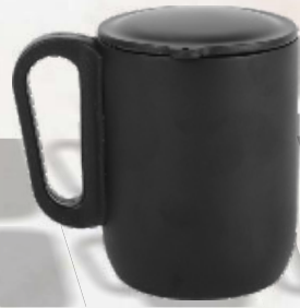
M - 03 Rs.345/-