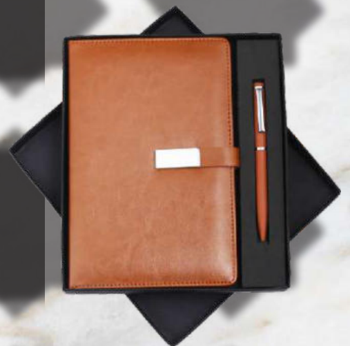
TF - 02 Rs.525/-

Branding, Delivery & GST will be charged extra