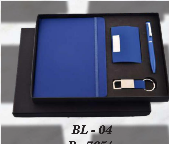
BL - 04 Rs.765/-