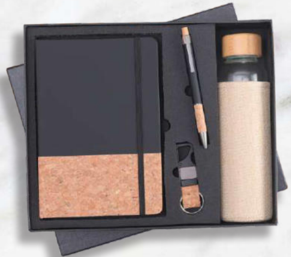
Black Cork - BDPK Rs.1275/-