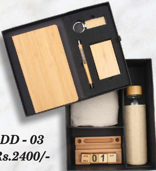
DD - 03 Rs.2400/-