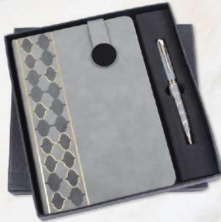
GW - 02 Rs.765/-