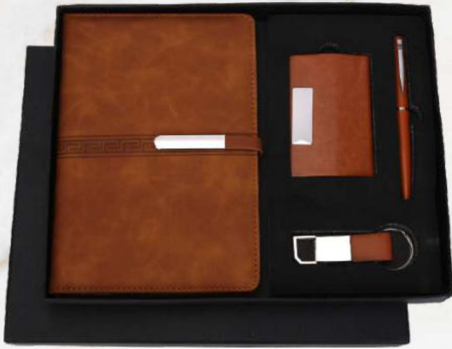
TC - 04 Rs.900/-

HSN - 420211 | GST RATE 18% | MASTER CARTON PACKING 20 Qty