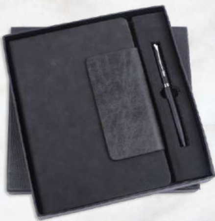
DF - 01 Rs.705/-