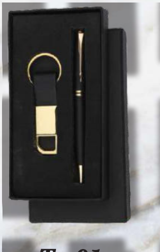
T - 01 Rs.375/-