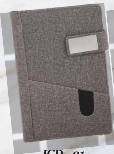
JCD - 01 Rs.435/-