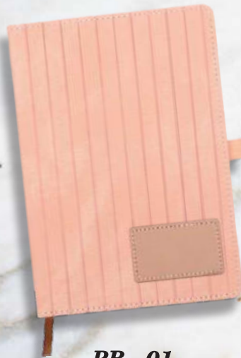
PR - 01 Rs.405/-