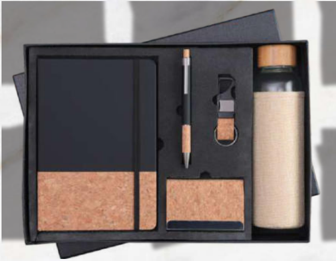
Black Cork -BDPKC Rs.1605/-

HSN - 732310 | GST RATE 18% | MASTER CARTON PACKING 10 Qty