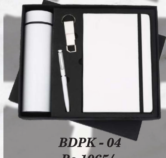
BDPK - 04 Rs.1065/-