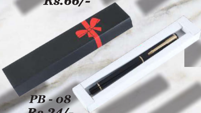
PB - 08 Rs.24/-

Branding, Delivery & GST will be charged extra