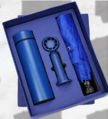
BUF - 02 Rs.1800/-