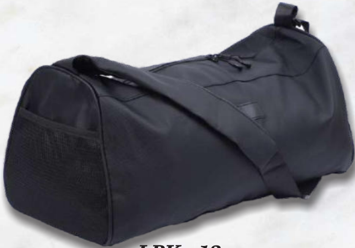
LPK - 13 Rs.900/-