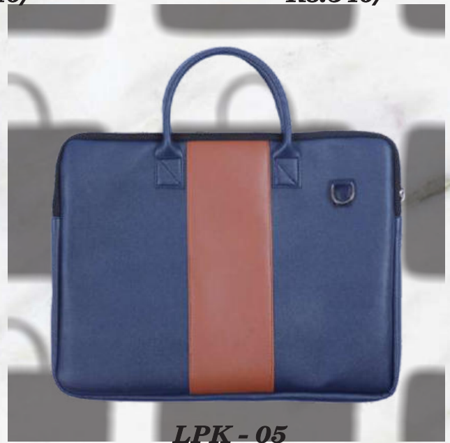
LPK - 05 Rs.1050/-