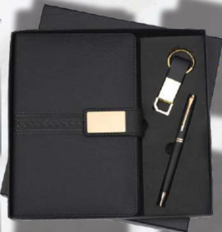
BG - 03 Rs.945/-