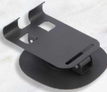
MS - 05 Rs.120/-