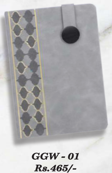
GGW - 01 Rs.465/-