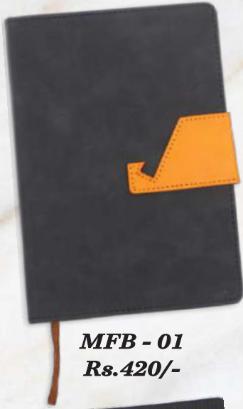
MFB - 01 Rs.420/-

HSN - 48101990 | GST RATE 18% | MASTER CARTON PACKING 100 Qty