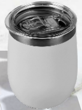
M - 06 Rs.480/-