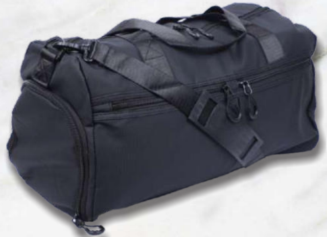
LPK - 14 Rs.1500/-