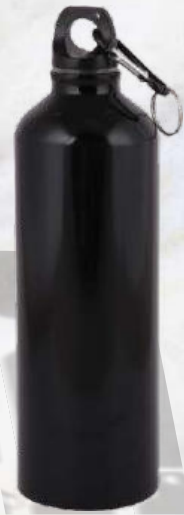
F - 11 Rs.345/-