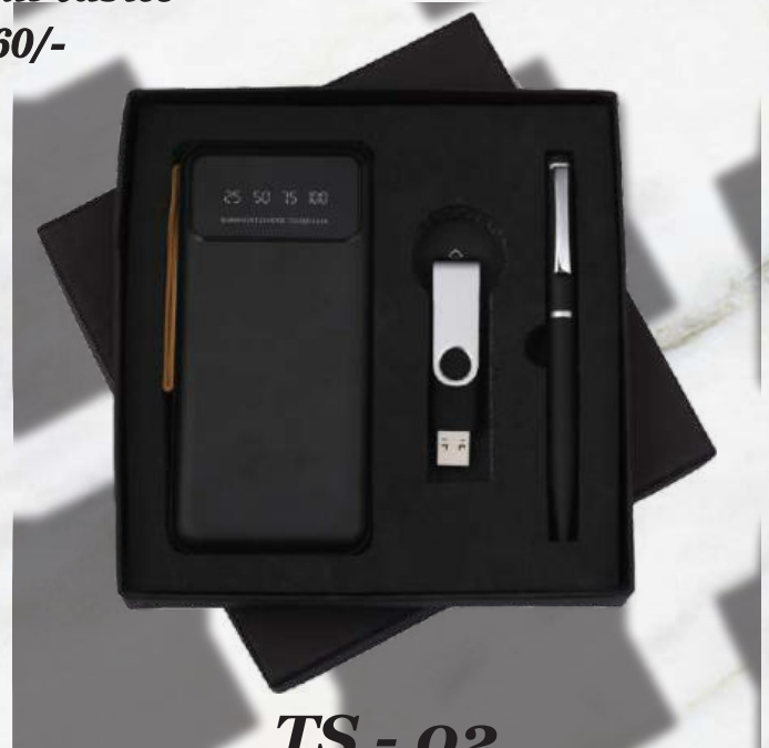
TS - 02