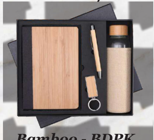
Bamboo - BDPK Rs.1335/-

Branding, Delivery & GST will be charged extra