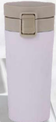
M - 08 Rs.465/-