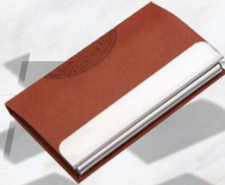
C - 05 Rs.180/-