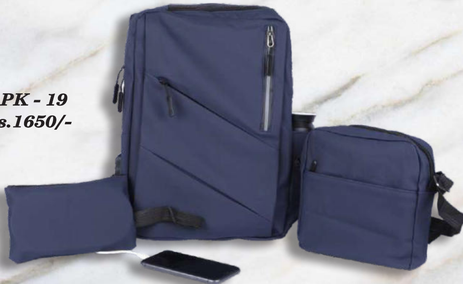
LPK - 19 Rs.1650/-

Branding, Delivery & GST will be charged extra