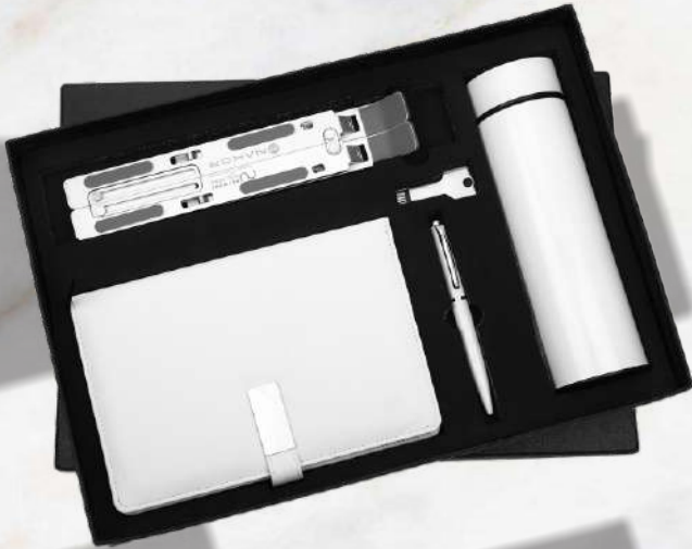
BDSPP - 01 Rs.2640/-

HSN - 660199 | GST RATE 18% | MASTER CARTON PACKING 10 Qty