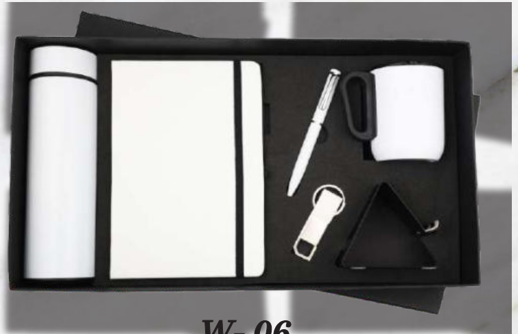
W - 06 Rs.1830/-