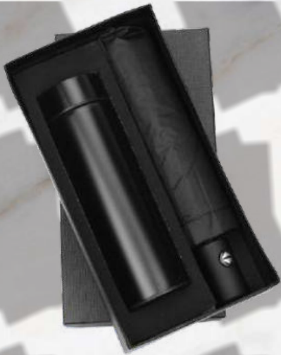
BU - 01 Rs.1140/-

HSN - 660199 | GST RATE 18% | MASTER CARTON PACKING 15 Qty