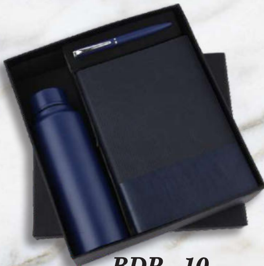
BDP - 10 Rs.1080/-