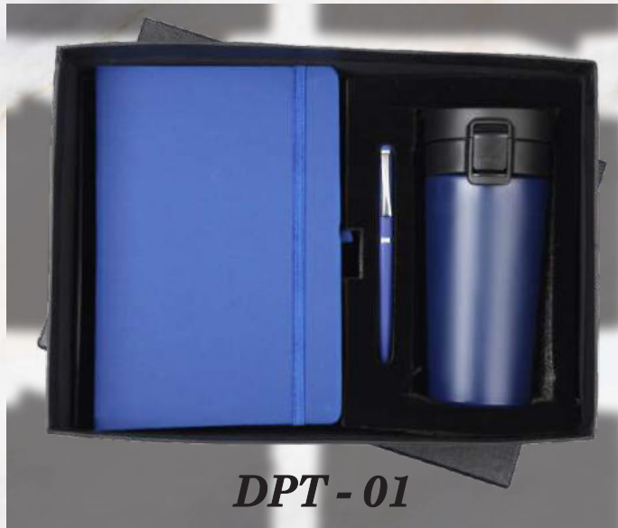
DPT - 01 Rs.1350/-

HSN - 732393 | GST RATE 18% | MASTER CARTON PACKING 10 Qty