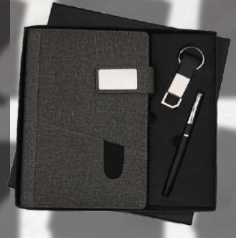
JC - 03 Rs.765/-