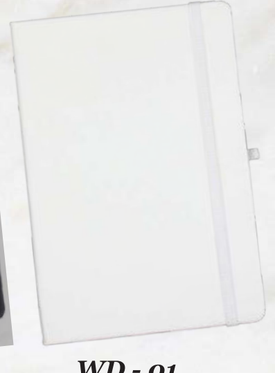
WD - 01 Rs.171/-