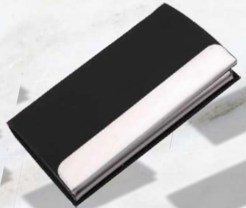
C - 06 Rs.165/-