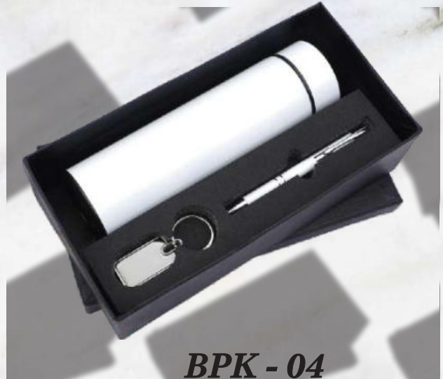
BPK - 04 Rs.735/-