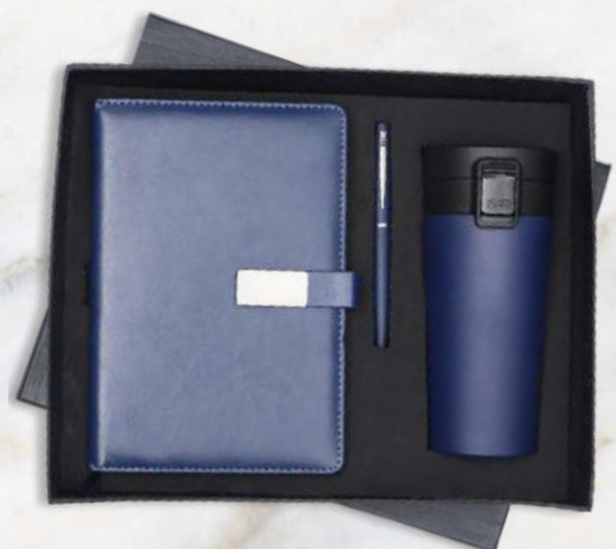
DPT - 05 Rs.1500/-

Branding, Delivery & GST will be charged extra