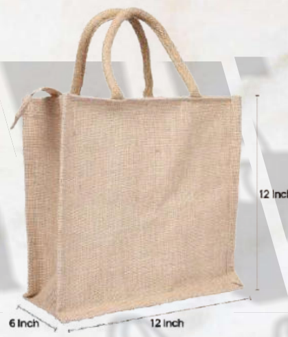
Jute Bag Small Rs.210/-