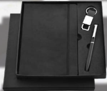
B - 03 Rs.555/-