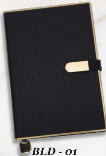
BLD - 01 Rs.315/-