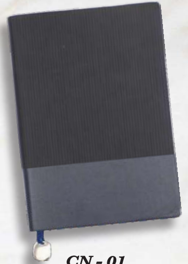
CN - 01 Rs.330/-