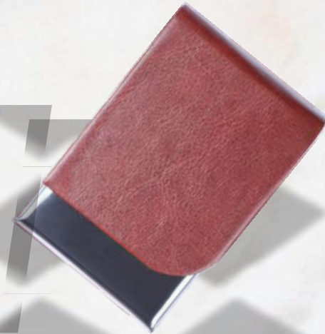
C - 11 Rs.165/-