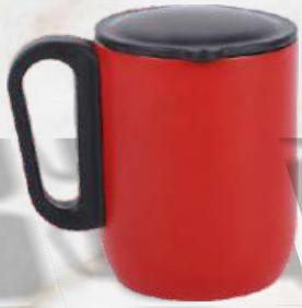
M - 01 Rs.360/-

HSN - 70139900 | GST RATE 18% | MASTER CARTON PACKING 60 Qty