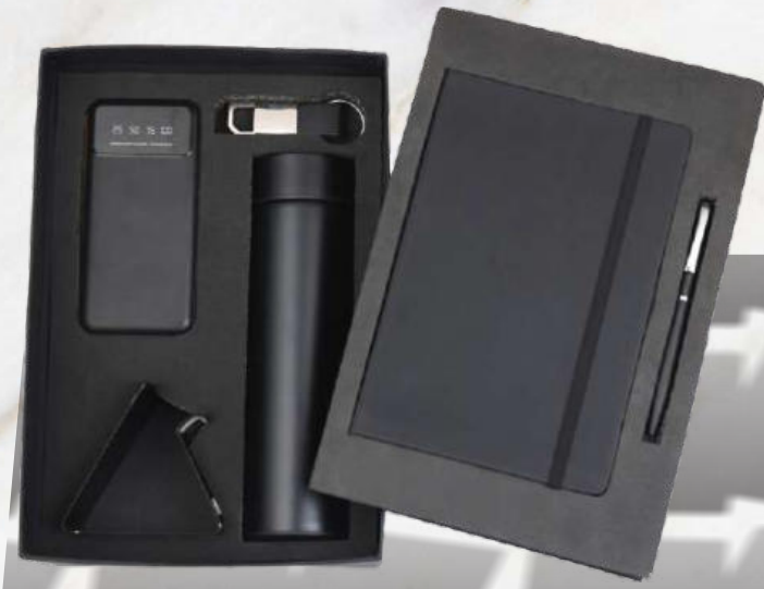
DD - 01 Rs.2850/-

HSN - 732393 | GST RATE 18% | MASTER CARTON PACKING 10 Qty