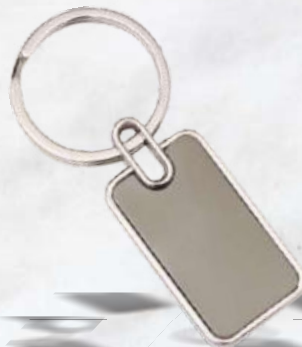
K - 06 Rs.66/-