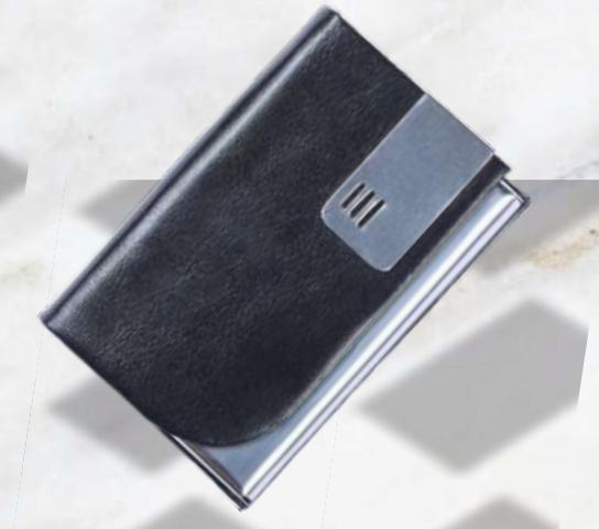
C - 14 Rs.180/-

Branding, Delivery & GST will be charged extra