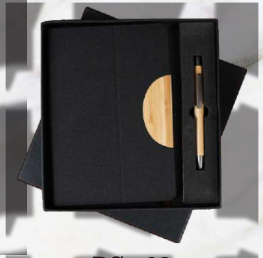
BS - 02 Rs.615/-