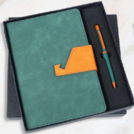
MF - 02 Rs.705/-