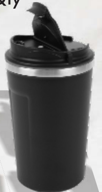
M - 05 Rs.780/-