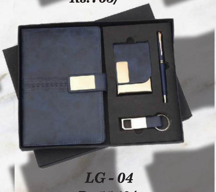
LG - 04 Rs.1140/-

Branding, Delivery & GST will be charged extra