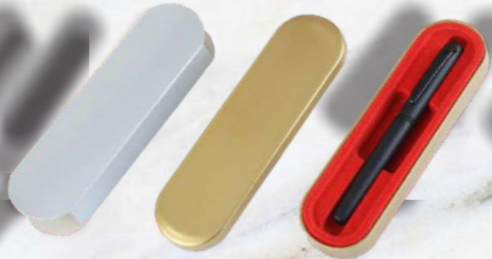
PB - 05 Rs.66/-