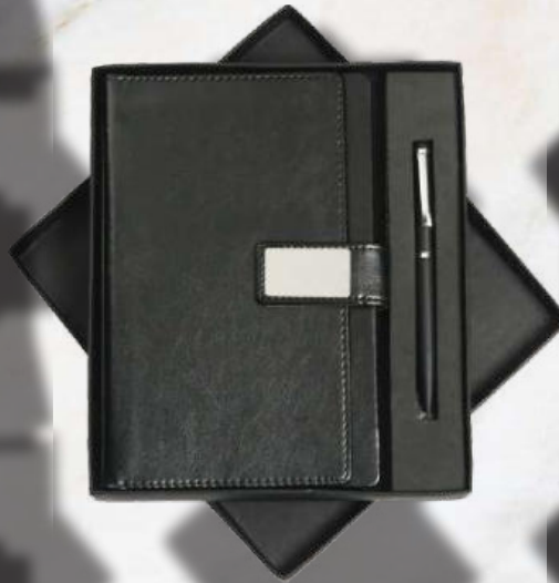
BO - 02 Rs.615/-