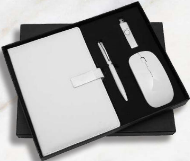
TS - 05 Rs.1860/-

HSN - 732393 | GST RATE 18% | MASTER CARTON PACKING 40/20 Qty