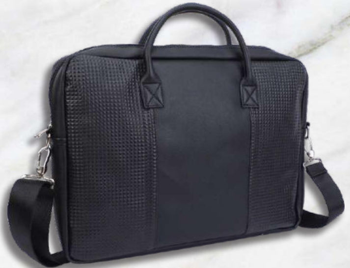
LPK - 10 Rs.1680/-