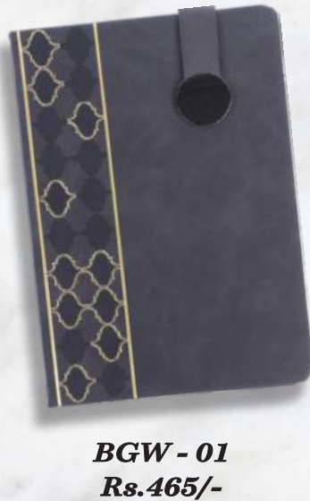
BGW - 01 Rs.465/-