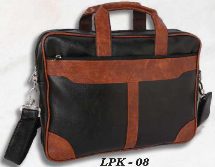
LPK - 08 Rs.1200/-