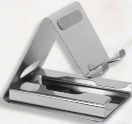
MS - 02 Rs.3600/-