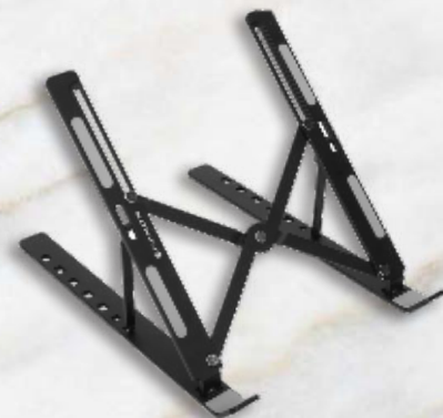
LS - 02 Rs.450/-

Branding, Delivery & GST will be charged extra