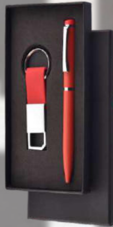
R - 01 Rs.240/-