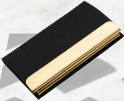
C - 04 Rs.210/-