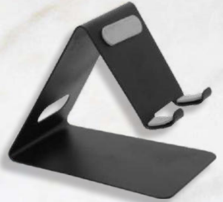
MS - 03 Rs.150/-