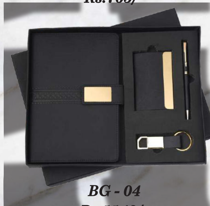
BG - 04 Rs.1140/-