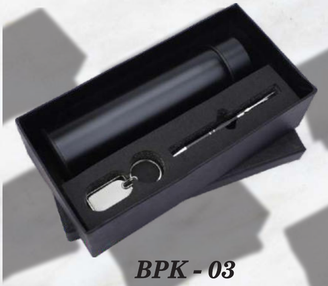
BPK - 03 Rs.735/-