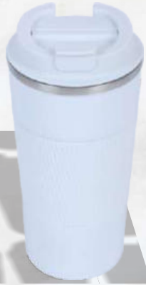
M - 06 Rs.780/-