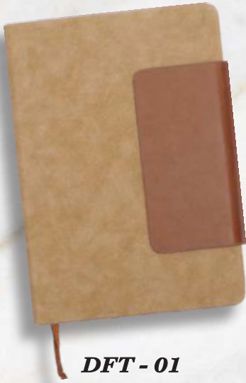
DFT - 01 Rs.435/-

HSN - 48101990 | GST RATE 18% | MASTER CARTON PACKING 100 Qty