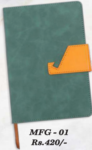
MFG - 01 Rs.420/-