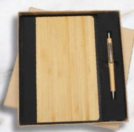
Bamboo - 02 Rs.585/-