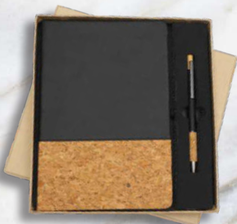
BC - 02 Rs.585/-