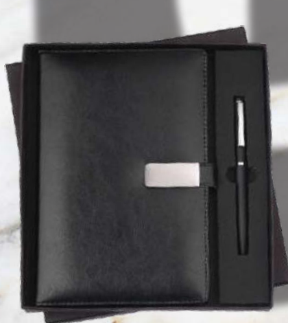
BF - 02 Rs.525/-