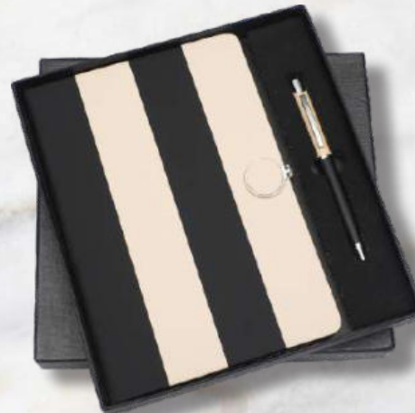
ZB - 02 Rs.660/-

Branding, Delivery & GST will be charged extra