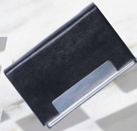
C - 08 Rs.165/-