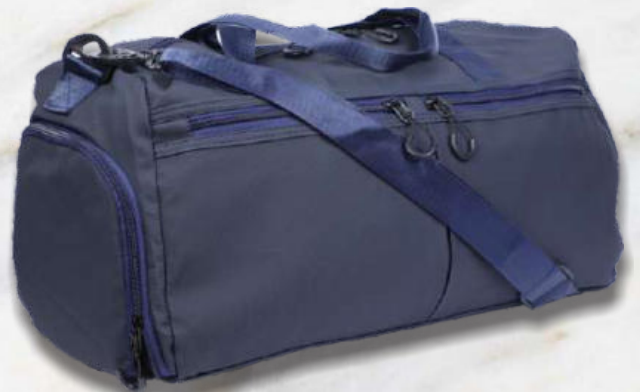
LPK - 16 Rs.1500/-

Branding, Delivery & GST will be charged extra