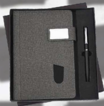
JC - 02 Rs.630/-