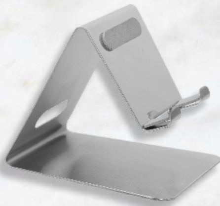
MS - 04 Rs.180/-