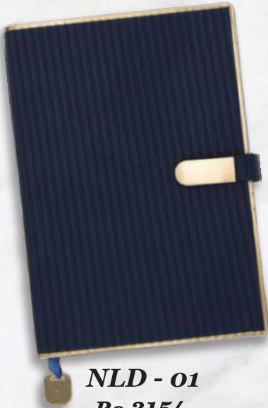
NLD - 01 Rs.315/-