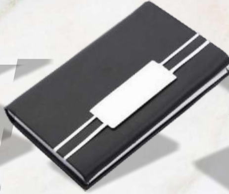
C - 02 Rs.150/-