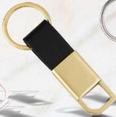
K - 03 Rs.180/-