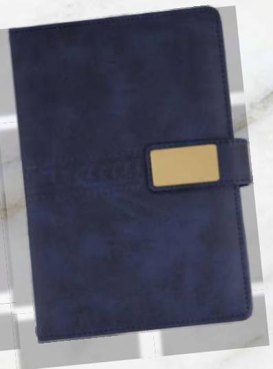
LG - 01 Rs.405/-