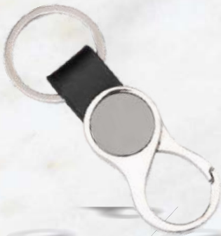
K - 05 Rs.96/-