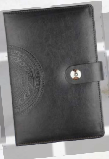
BTD - 01 Rs.405/-