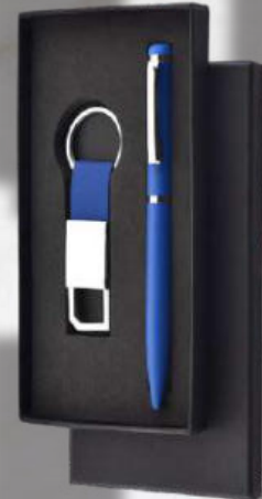
BL - 01 Rs.240/-