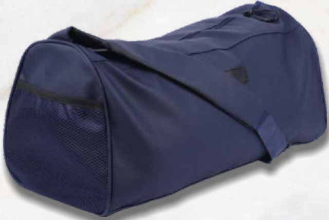
LPK - 12 Rs.900/-

HSN - 42021990 | GST RATE 18% | MASTER CARTON PACKING 25 Qty