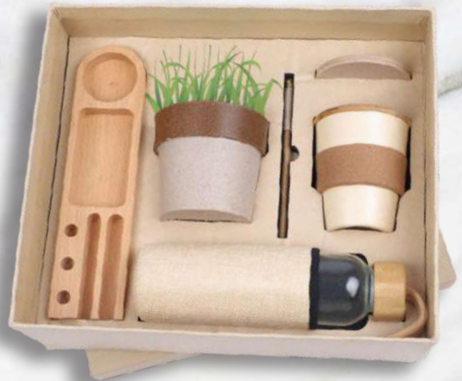
ECO 6-1 Rs.2160/-