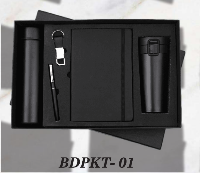
BDPKT- 01 Rs.1800/-

HSN - 732393 | GST RATE 18% | MASTER CARTON PACKING 10 Qty