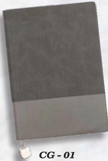
CG - 01 Rs.330/-