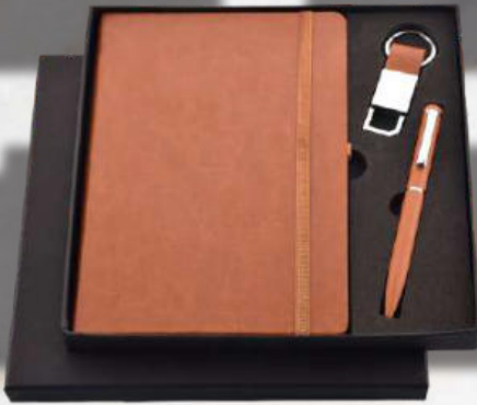
T - 03 Rs.555/-

HSN - 420211 | GST RATE 18% | MASTER CARTON PACKING 40 Qty