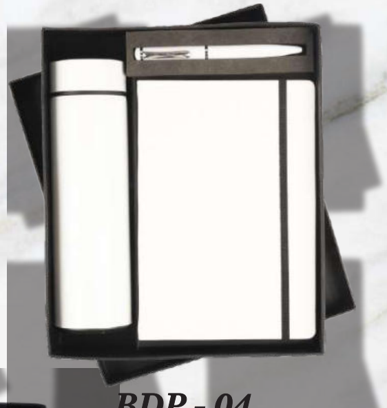
BDP - 04 Rs.930/-