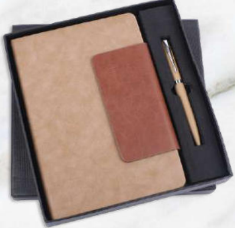
DF - 03 Rs.705/-