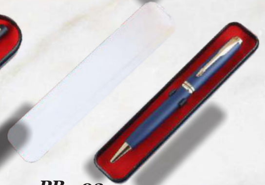
PB - 03 Rs.30/-