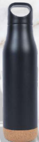
F - 07 Rs.37/-

Branding, Delivery & GST will be charged extra