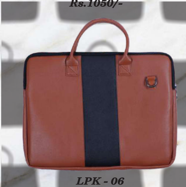
LPK - 06 Rs.1050/-

Branding, Delivery & GST will be charged extra