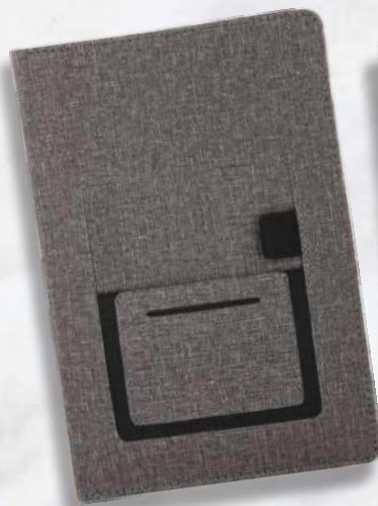
JPDG - 01 Rs.291/-