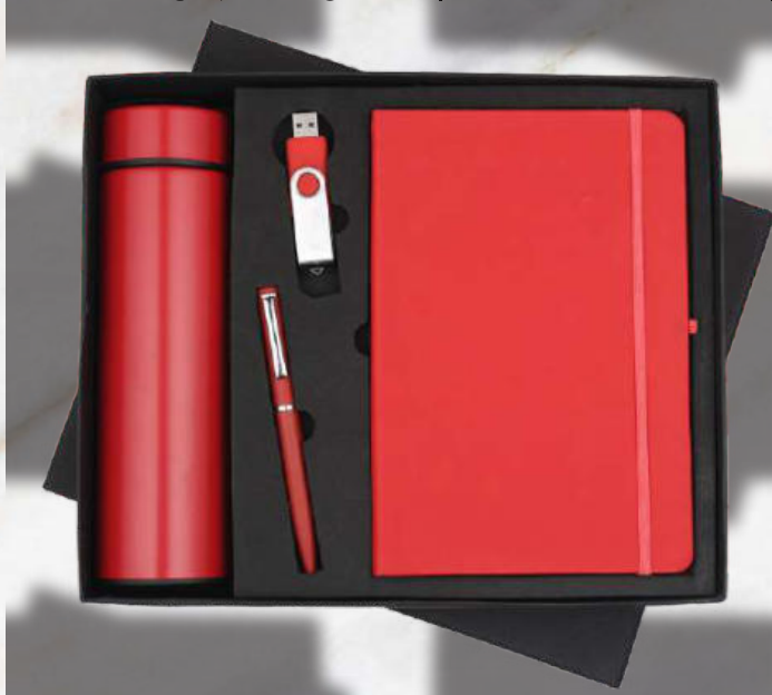
BPPD - 01 Rs.1710/-

HSN - 420211 | GST RATE 18% | MASTER CARTON PACKING 10 Qty