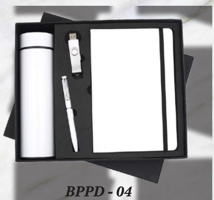
BPPD - 04 Rs.1710/-

Branding, Delivery & GST will be charged extra