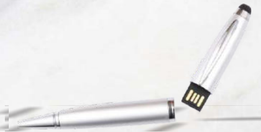
Pen Pendrive 02