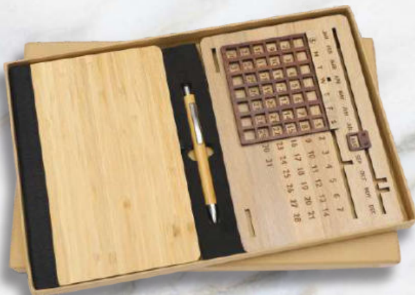
DCP - 02 Rs.1050/-