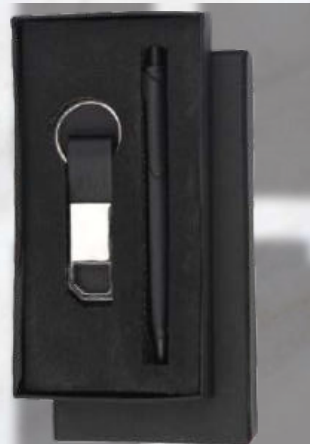
BK - 01 Rs.210/-