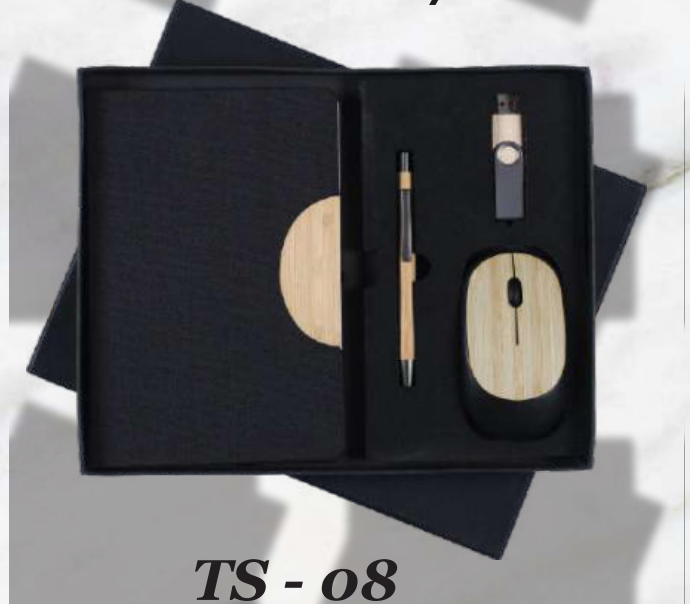
TS - 08 Rs.2100/-