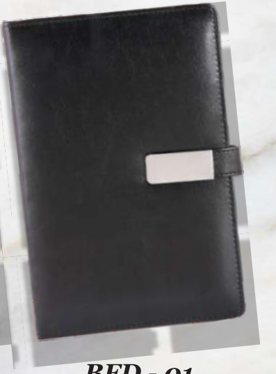
BFD - 01 Rs.300/-

Branding, Delivery & GST will be charged extra