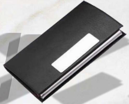
C - 03 Rs.120/-