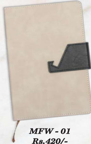
MFW - 01 Rs.420/-