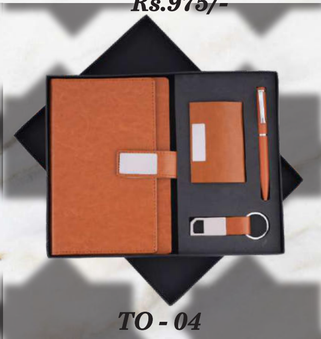
TO - 04 Rs.975/-

Branding, Delivery & GST will be charged extra