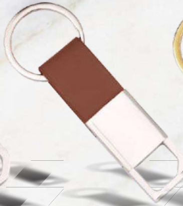
K - 02 Rs.96/-