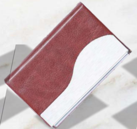
C - 09 Rs.165/-

Branding, Delivery & GST will be charged extra