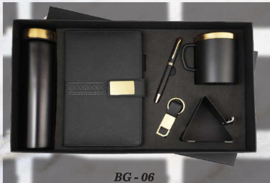
BG - 06 Rs.2490/-

Branding, Delivery & GST will be charged extra