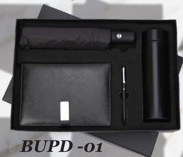
BUPD - 01 Rs.1890/-