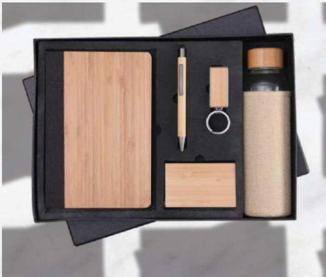
Bamboo- BDPKC Rs.1620/-