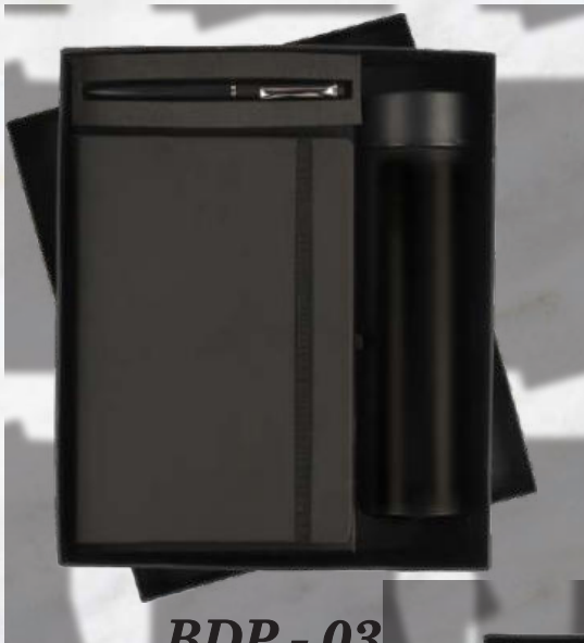
BDP - 03 Rs.930/-