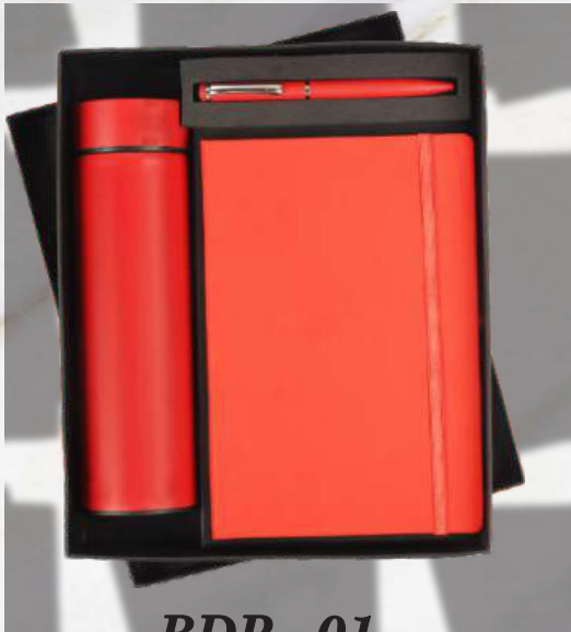
BDP - 01 Rs.930/-

HSN - 732393 | GST RATE 18% | MASTER CARTON PACKING 10 Qty