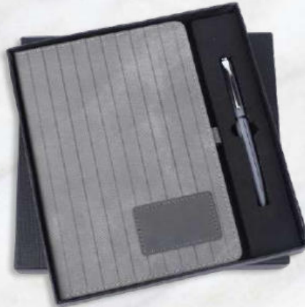
RG - 02 Rs.705/-