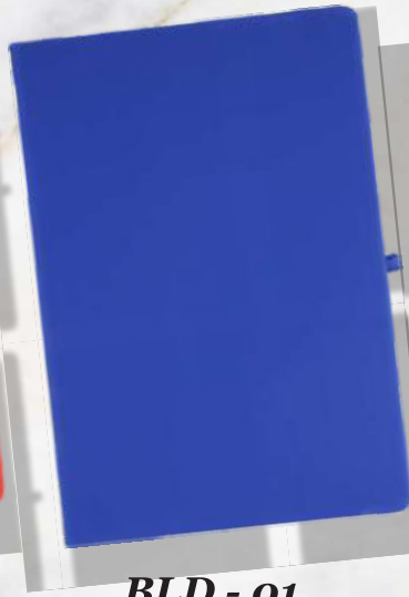
BLD - 01 Rs.171/-