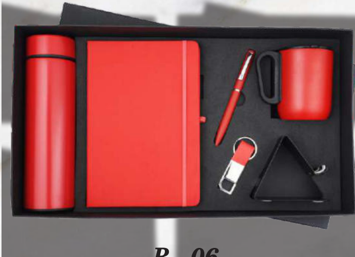
R - 06 Rs.1950/-

HSN - 732393 | GST RATE 18% | MASTER CARTON PACKING 10 Qty