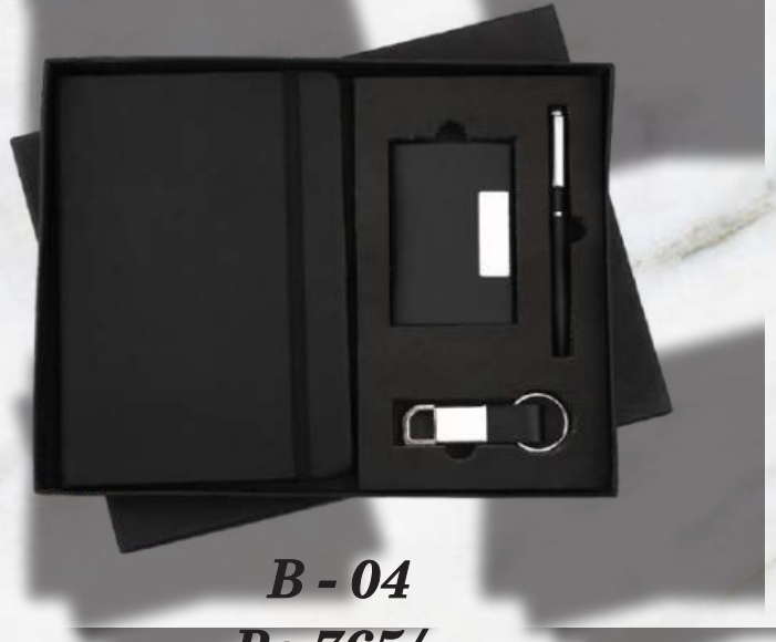
B - 04 Rs.765/-