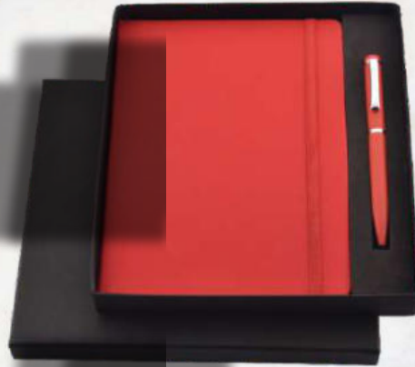
R - 02 Rs.390/-