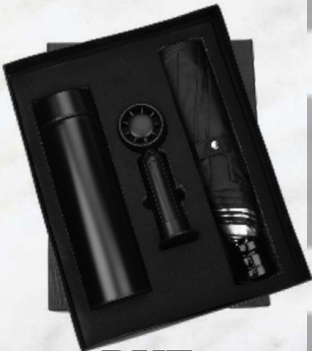
BUF - 01 Rs.1800/-