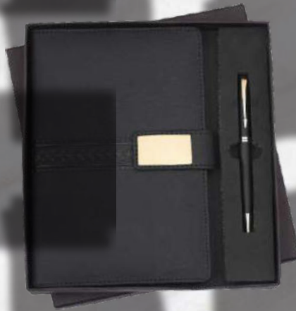
BG - 02 Rs.645/-