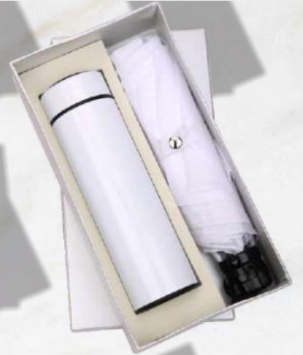
BU - 03 Rs.1140/-