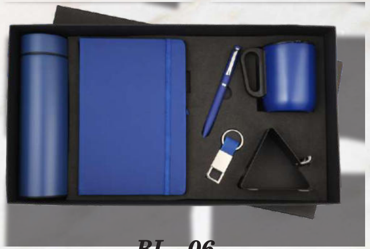
BL - 06 Rs.1950/-