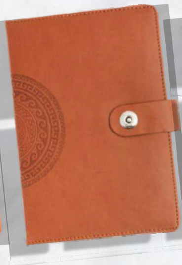
TD - 01 Rs.405/-