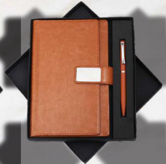
TO - 02 Rs.615/-