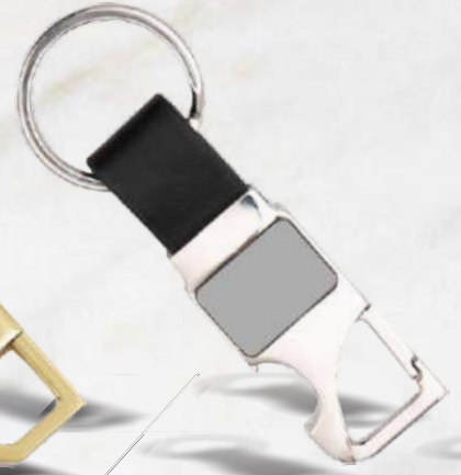
K - 04 Rs.96/-