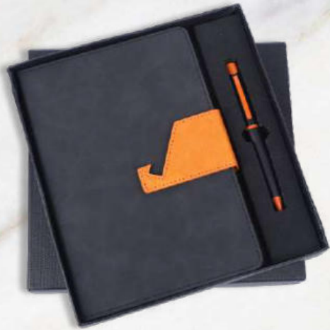
MF - 01 Rs.705/-

HSN - 482010 | GST RATE 18% | MASTER CARTON PACKING 30 Qty