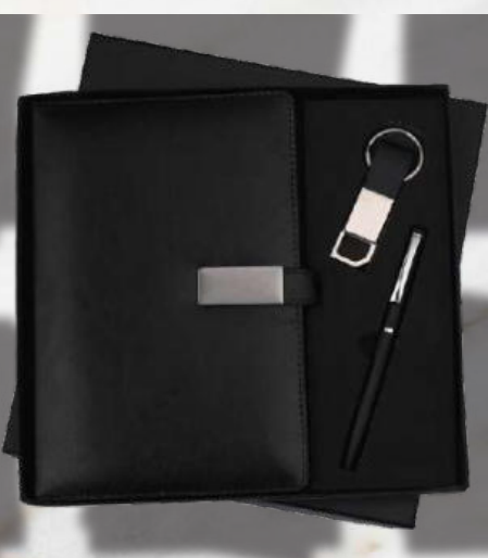
TF - 03 Rs.705/-

Branding, Delivery & GST will be charged extra