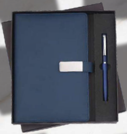
BLF - 02 Rs.525/-

HSN - 482010 | GST RATE 18% | MASTER CARTON PACKING 30 Qty