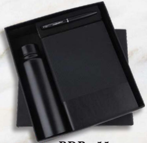
BDP - 11 Rs.1080/-

Branding, Delivery & GST will be charged extra