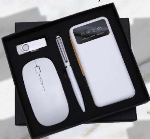
TS - 03