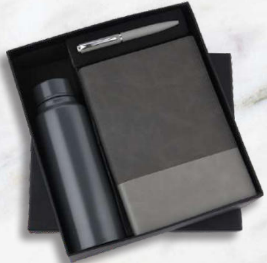
BDP - 09 Rs.1080/-