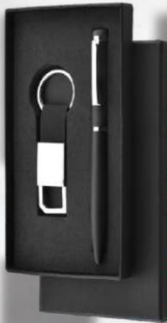
B - 01 Rs.240/-