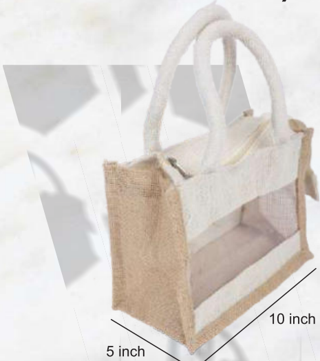
PVC Jute Bag Rs.180/-