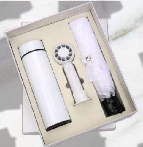
BUF - 03 Rs.1800/-