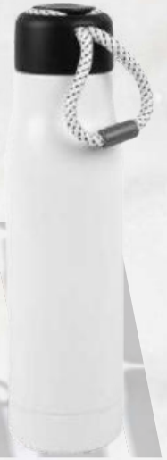
F- 06 Rs.600/-