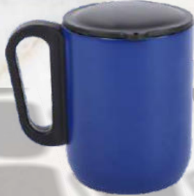
M - 02 Rs.360/-