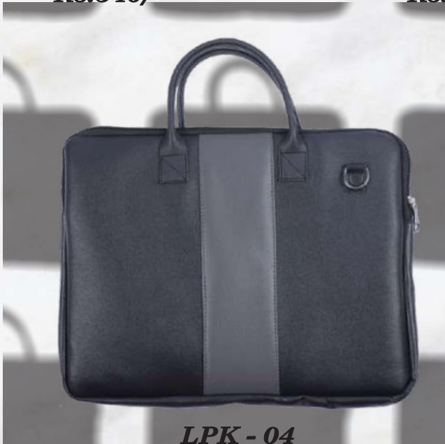
LPK - 04 Rs.1050/-