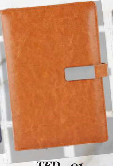
TFD - 01 Rs.300/-