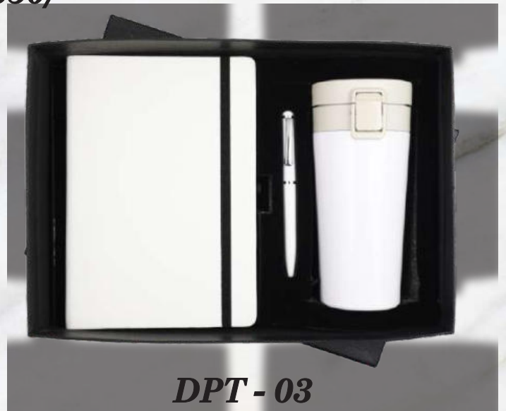
DPT - 03 Rs.1170/-