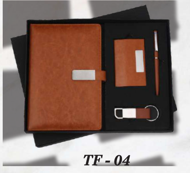
TF - 04 Rs.870/-