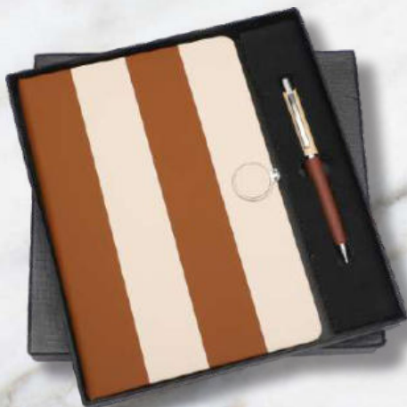
ZT - 02 Rs.660/-