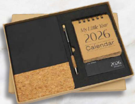
DCP - 03 Rs.1095/-

Branding, Delivery & GST will be charged extra