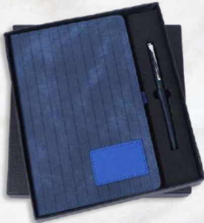
RN- 01 Rs.705/-