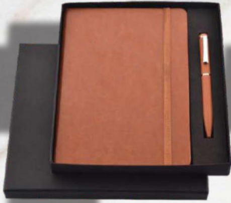
T - 02 Rs.390/-

HSN - 482010 | GST RATE 18% | MASTER CARTON PACKING 30 Qty