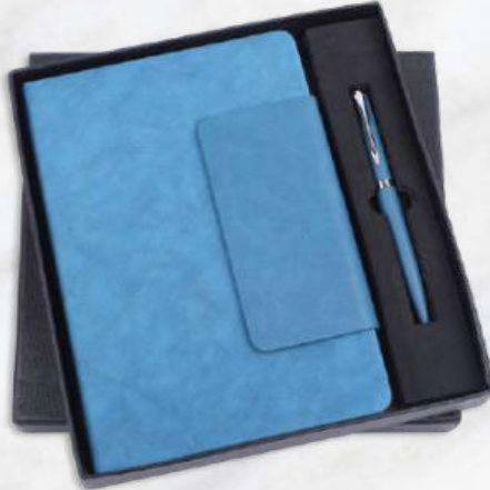
DF - 02 Rs.705/-