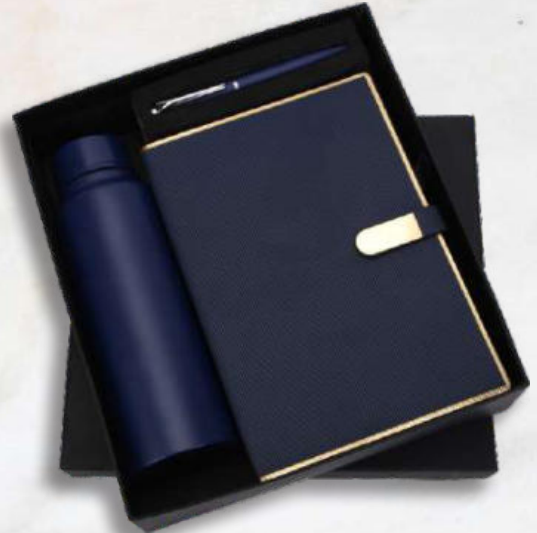
BDP - 07 Rs.1230/-