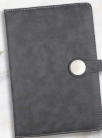
BRD - 01 Rs.360/-