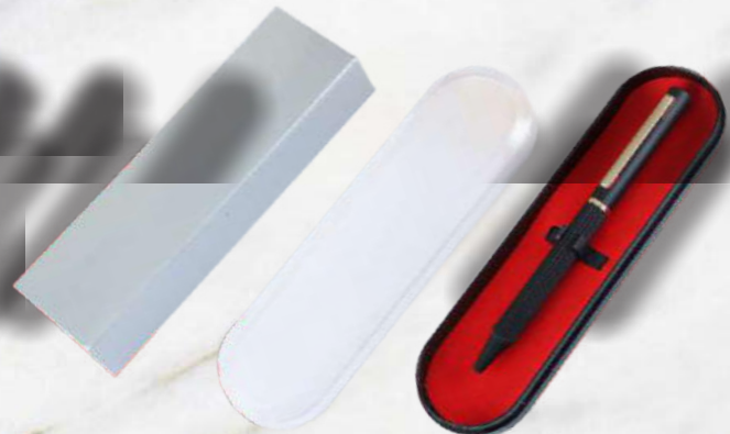
PB - 07 Rs.66/-