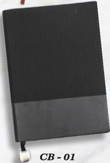
CB - 01 Rs.330/-