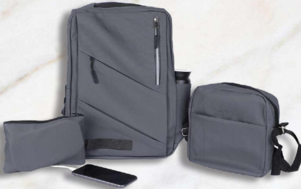
LPK - 17 Rs.1650/-

HSN - 42021990 | GST RATE 18% | MASTER CARTON PACKING 25 Qty