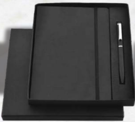
B - 02 Rs.390/-