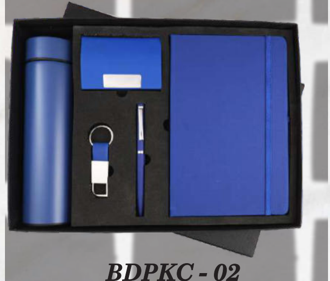
BDPKC - 02