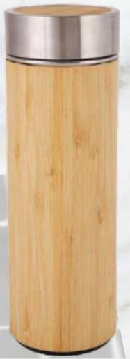
F- 12 Rs.855/-