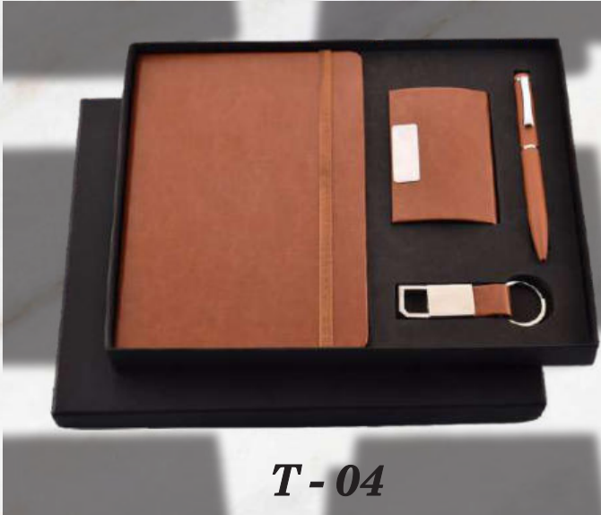
T - 04 Rs.765/-

HSN - 420211 | GST RATE 18% | MASTER CARTON PACKING 20 Qty