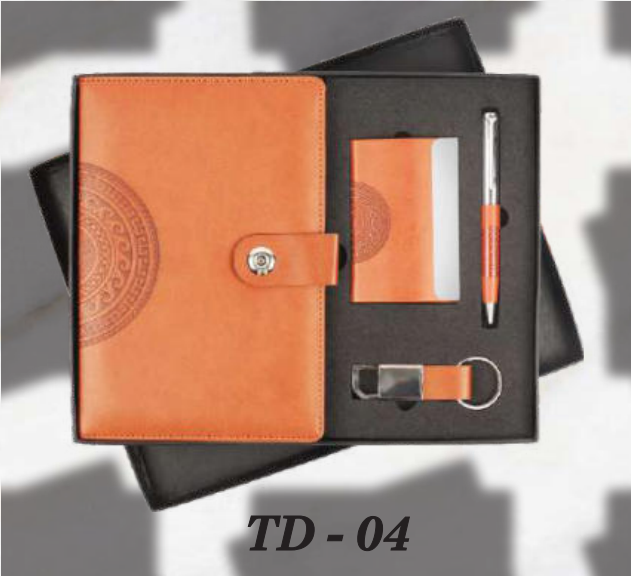
TD - 04 Rs.1080/-

HSN - 420211 | GST RATE 18% | MASTER CARTON PACKING 20 Qty