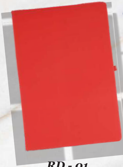
RD - 01 Rs.171/-

HSN - 48101990 | GST RATE 18% | MASTER CARTON PACKING 100 Qty