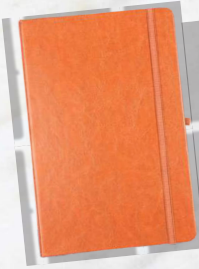
TED - 01 Rs.171/-