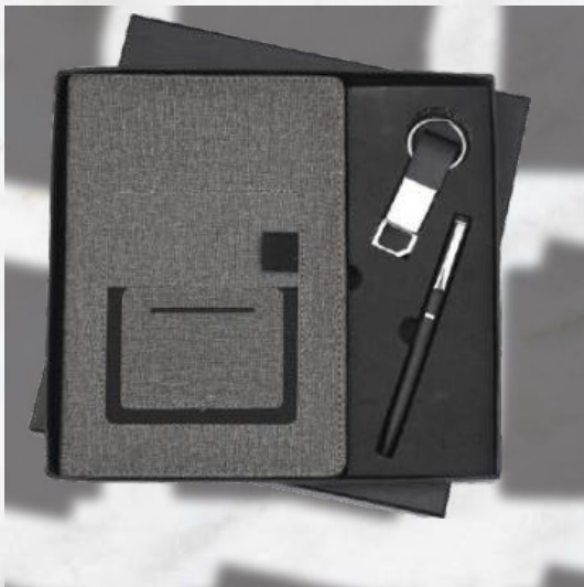
JP - 03 Rs.675/-