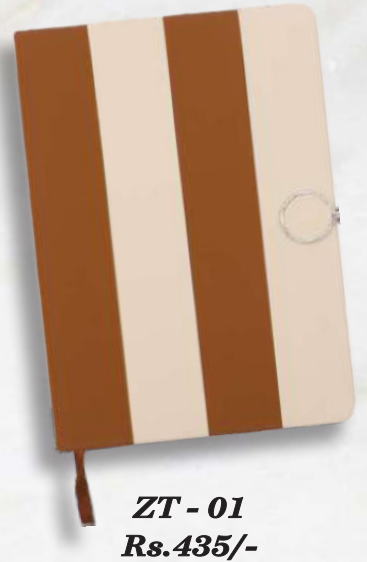
ZT - 01 Rs.435/-