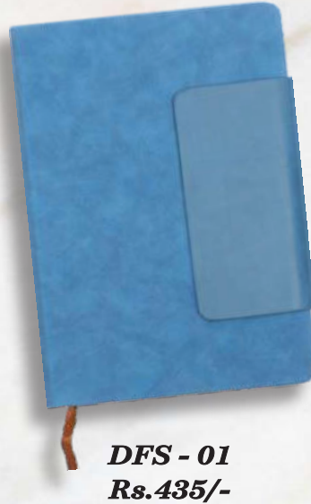
DFS - 01 Rs.435/-