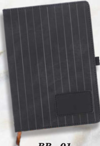
BR - 01 Rs.405/-