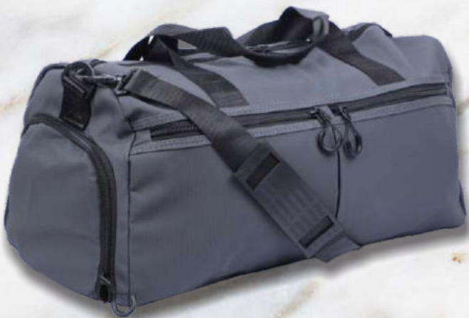
LPK - 15 Rs.1500/-