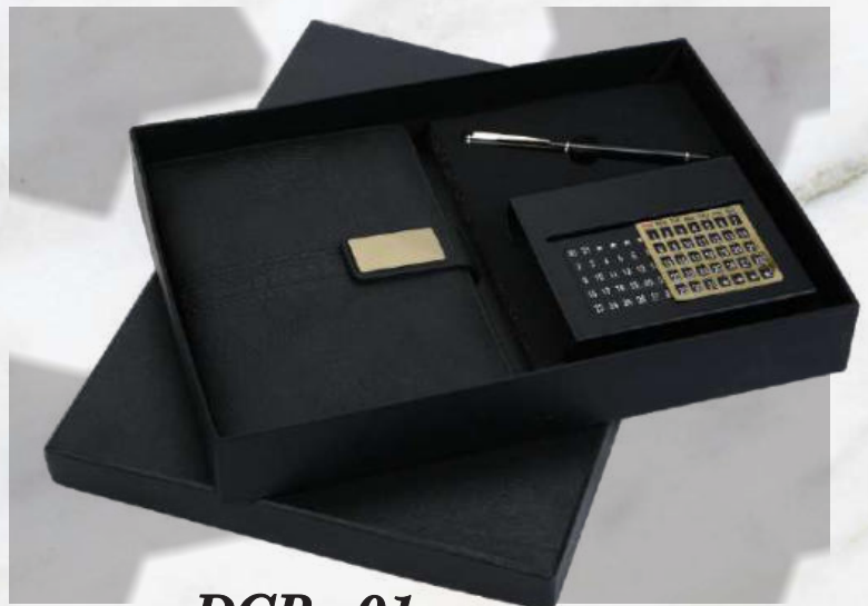
DCP - 01 Rs.1260/-