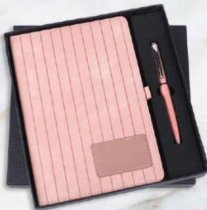
PN- 01 Rs.705/-

Branding, Delivery & GST will be charged extra