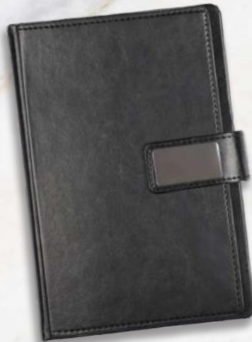
BOD - 01 Rs.420/-