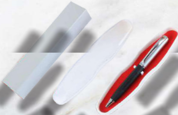
PB - 06 Rs.66/-