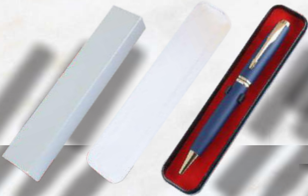
PB - 04 Rs.36/-