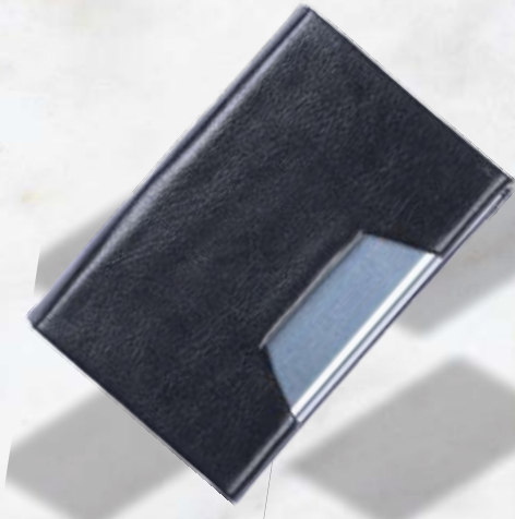
C - 13 Rs.150/-