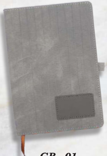
GR - 01 Rs.405/-

Branding, Delivery & GST will be charged extra