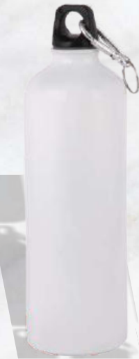
F - 10 Rs.345/-