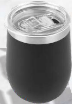
M - 09 Rs.480/-