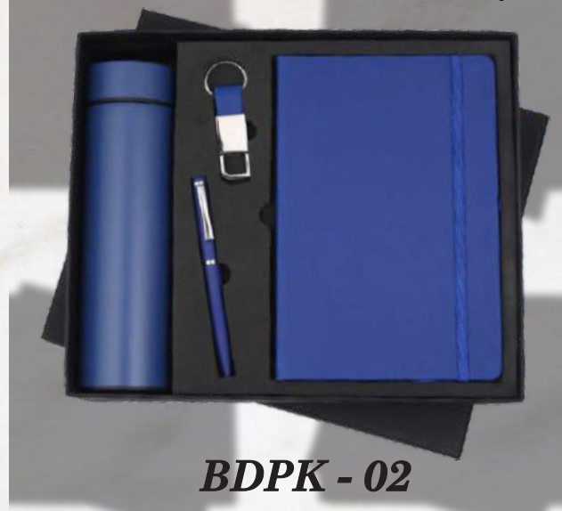
BDPK - 02 Rs.1065/-