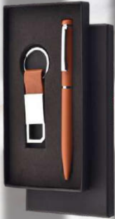
T - 01 Rs.240/-

HSN - 732611 | GST RATE 18% | MASTER CARTON PACKING 100 Qty