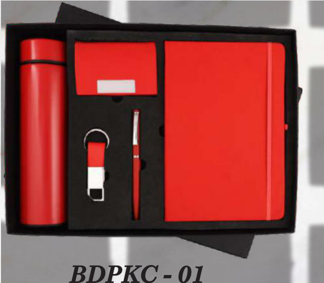
BDPKC - 01

HSN - 732310 | GST RATE 18% | MASTER CARTON PACKING 10 Qty