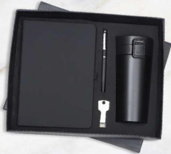
DPPT - 01 Rs.2070/-

HSN - 732393 | GST RATE 18% | MASTER CARTON PACKING 10 Qty