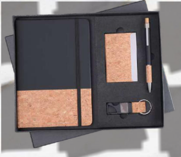
Black Cork - PDKC Rs.930/-

HSN - 420211 | 482010 | GST RATE 18% | MASTER CARTON PACKING 30/20 Qty