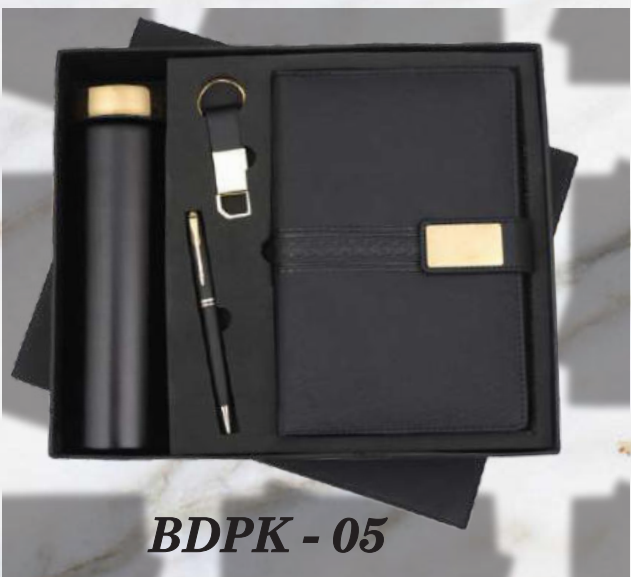
BDPK - 05 Rs.1680/-

Branding, Delivery & GST will be charged extra