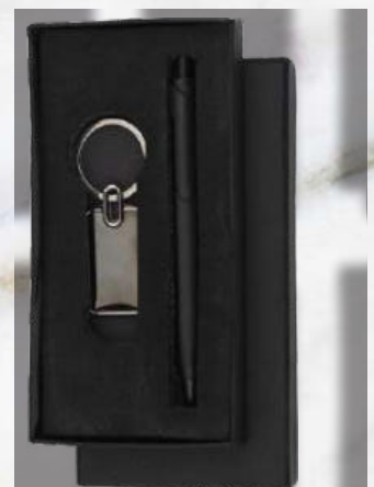
BS - 01 Rs.180/-