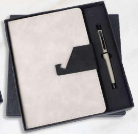
MF - 03 Rs.705/-