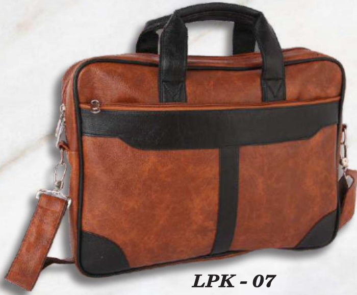
LPK - 07 Rs.1200/-

HSN - 42021990 | GST RATE 18% | MASTER CARTON PACKING 25 Qty