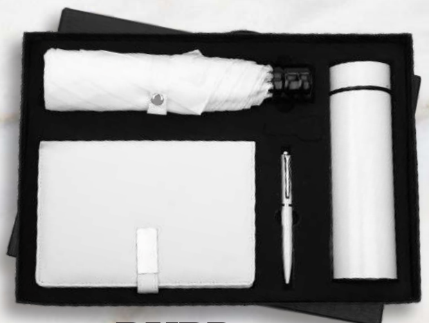
BUPD - 02 Rs.1890/-

Branding, Delivery & GST will be charged extra