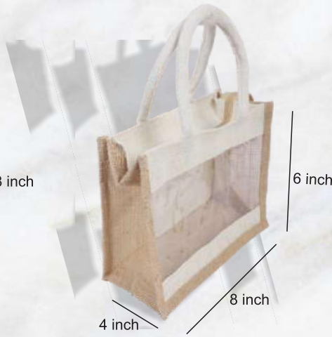
PVC Jute Bag Rs.156/-