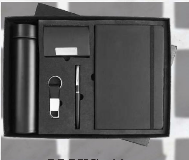
BDPKC - 03