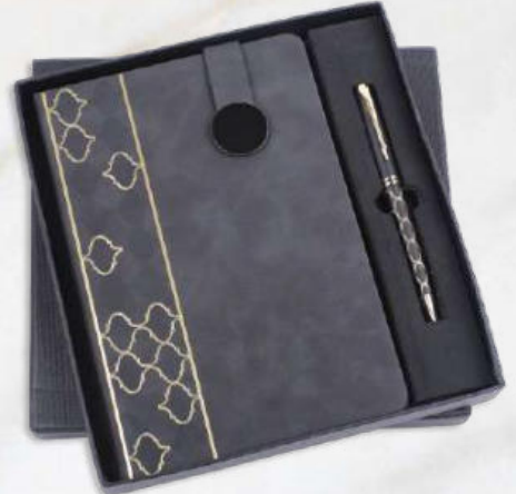
GW - 03 Rs.765/-