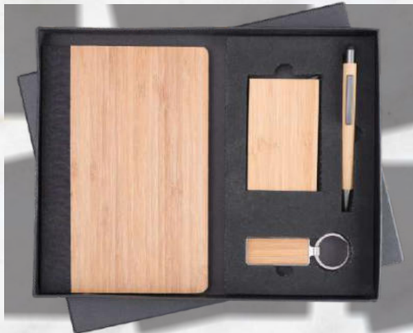
Bamboo - PDKC Rs.990/-